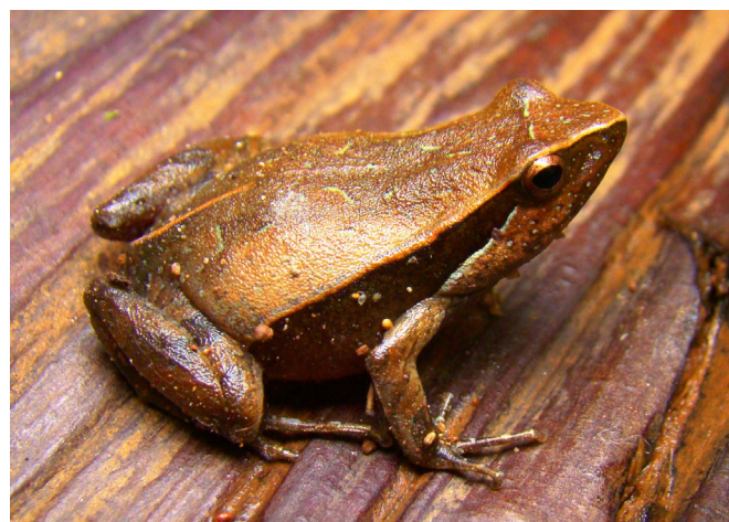
FIGURE 1. Physalaemus feioi (MZUFV 10150 in life; CRC 24.90 mm) from Simonésia, state of Minas Gerais, southeastern Brazil.

Physalaemus feioi is here reported from three new localities: 1) Sítio Carmelita (19°45'35" S, 42°05'23" W, 868 m elevation), municipality of Piedade de Caratinga (MZUFV 8775-8779, 10148, 10149, 10166), 2), a permanent pool (20°00'18" S, 42°06'34" W, 1234 m elevation; Figure 3B) and 3) a forest fragment (19°58'46" S, 42°02'44" W, 915 m elevation) both at the rural area of the municipality of Simonésia (MZUFV 10150 and UFMG 7218, respectively) (Figure 2). Specimens MZUFV 8775-8779 were collected on the forest floor on May 2008, while specimens MZUFV 10148, 10149, 10166 were collected on