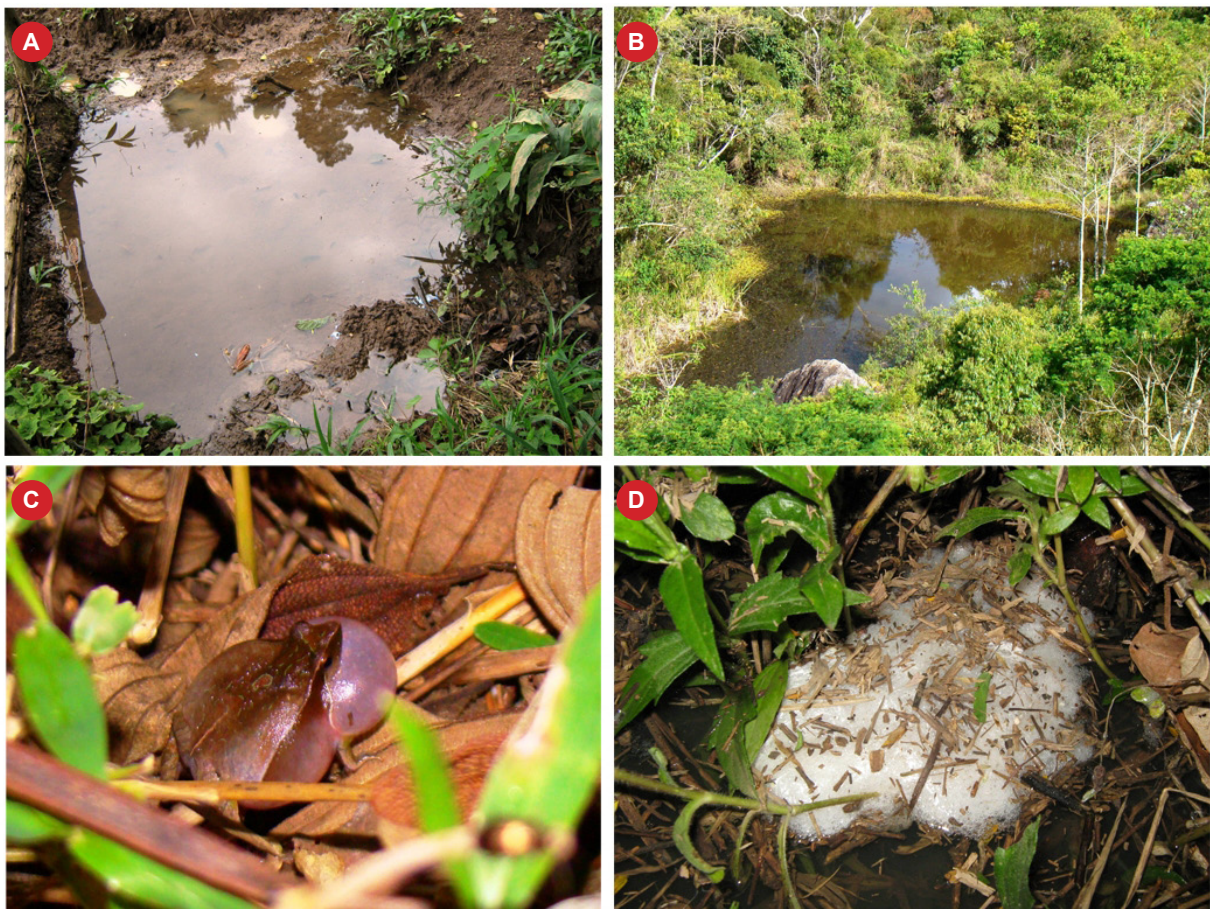
FIGURE 3. Collection sites and natural history aspects of Physalaemus feioi : A = Temporary pool at the edge of the forest fragment in Sítio Carmelita, Piedade de Caratinga (Photo: Harley L. Coelho); B = Pool in the rural area of Simonésia (Photo: Emanuel T. da Silva); C = Adult male of P. feioi in calling activity (Photo: Emanuel T. da Silva); D = foam nest of P. feioi at Sítio Carmelita (Photo: Harley L. Coelho).