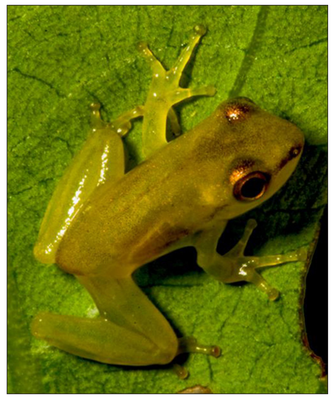
FIGURE 3. Scarthyla vigilans metamorph, Austin Trace.

On July 31 2007, between 15:00 and 17:30 h, RFD, DGT, JMS heard adult S. vigilans males calling from a man-made pond (Figure 4B) along the Bowen Trace, southern Trinidad (site B in Figure 2: 10°06'10.92" N, 61°46'49.58" W). Calling activity intensified in breezy conditions and the scratchy twittering call, cricket-like individually, sounded en masse like wind blowing through grass. When approached, frogs would either dive into the water or quickly jump across the water surface and proved difficult to capture. A single frog measuring 17.5 mm SVL (Figure 5A) was collected from this site. No tadpoles were found in several sweeps of the edge margins. Synbranchus marmoratus elvers, cyprinodontid fish Rivulus hartii and juvenile caiman (Caiman crocodilus) were present at the site. Sympatric frog species at this site included: Pseudis paradoxa, and Sphaenorhynchus lacteus.