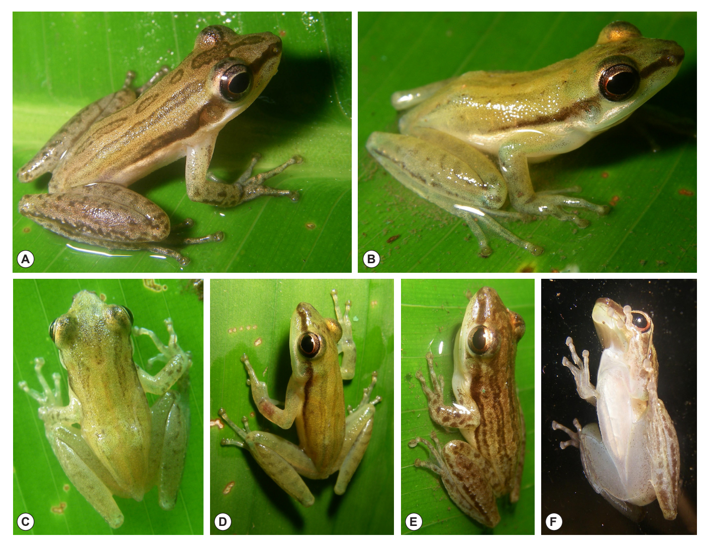
FIGURE 5. Scarthyla vigilans, adult frogs from southern Trinidad: (A) Immature female collected from Bowen Trace, 2007: GLAHM 140268 (B-D) Male frogs collected from Columbia Road, 2007: GLAHM 140270 (E-F) Female frog collected from Columbia Road, 2007: GLAHM 140270. For SVL measurements please see text. (Photos: J.M. Smith).

It is difficult to know how recently this 'colonization' has taken place in Trinidad. It is possible that the species has been present for a while; certainly the numbers in which it is now present in the South appear considerable. Rojas-Runjaic et al. (2008) discuss the lack of previous records from the historically well sampled areas in Venezuela in which they were working. They suggest that their recent discovery in those areas is either due to an ongoing geographic expansion by the species or that they may have been under-recorded due to their inconspicuous advertisement calls, particularly where other amphibians with louder calls are active. Armesto et al. (2009) and Rojas-Runjaic et al. (2008) both record Scarthyla vigilans in sympatry with Dendropsophus microcephalus and Scinax gr. ruber, species with loud, shrill calls. In Trinidad, Scarthyla vigilans were found sympatrically with Dendropsophus minusculus, D. microcephalus, Engystomops pustulosus, Sphaenorhynchus lacteus, Scinax gr. ruber and Pseudis paradoxa, all of which have louder calls than the obscure, insect-like trill of Scarthyla vigilans. It is possible therefore that, in spite of regular night surveys by teams from the University of Glasgow in the South of Trinidad over the past twenty years, the frog has been missed (particularly if burrowing behaviour observed in frogs under captive conditions (JMS, RFD, DGT, personal observations) is