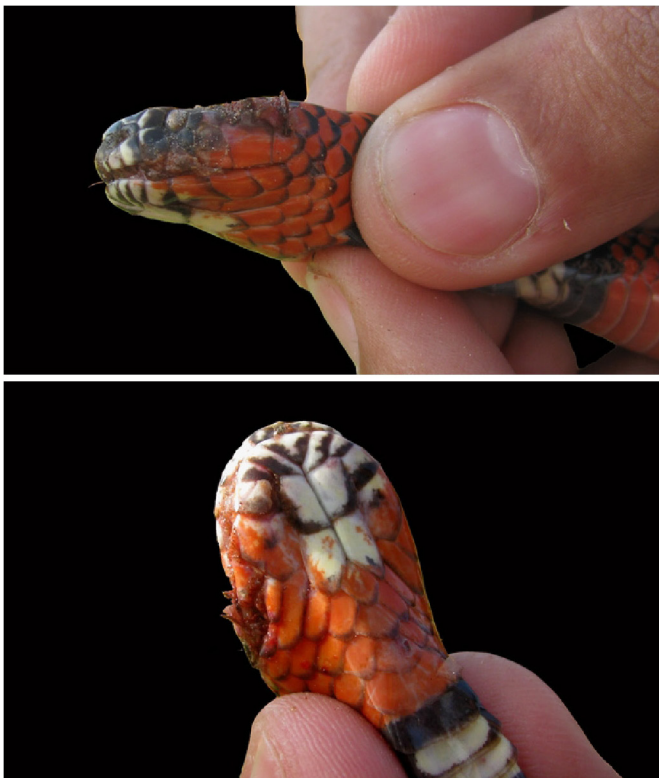
FIGURE 3. Lateral (above) and ventral (below) views of the head of the specimen of M. silviae from Paraguay, note head injuries.

respect to the Figure 2 of the original description, two last supralabials are red (gray in the picture), and white gulars, as our specimen (Figure 3). According to Di Bernardo et al. (2007) there are four species of coral snakes with the middle black ring wider than the external ones in each triad: M. pyrrhocryptus , Micrurus tricolor (Hoge, 1956), M.