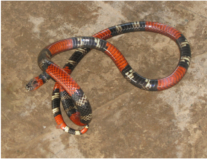
FIGURE 2. Dorsal and ventral view of specimen of M. silviae recorded in Paraguay; note partially everted right hemipenis.

respect to the Figure 2 of the original description, two last supralabials are red (gray in the picture), and white gulars, as our specimen (Figure 3). According to Di Bernardo et al. (2007) there are four species of coral snakes with the middle black ring wider than the external ones in each triad: M. pyrrhocryptus , Micrurus tricolor (Hoge, 1956), M.