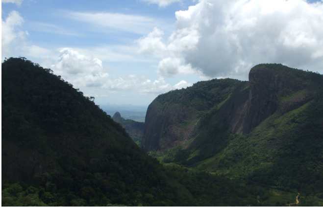
FIGURE 1. Landscape of the forests of the Serra das Torres mountains, in the municipality of Atílio Vivacqua, Espírito Santo state, SE Brazil.

Zachaenus parvulus (Girard, 1853) (Figure 2b), a forest