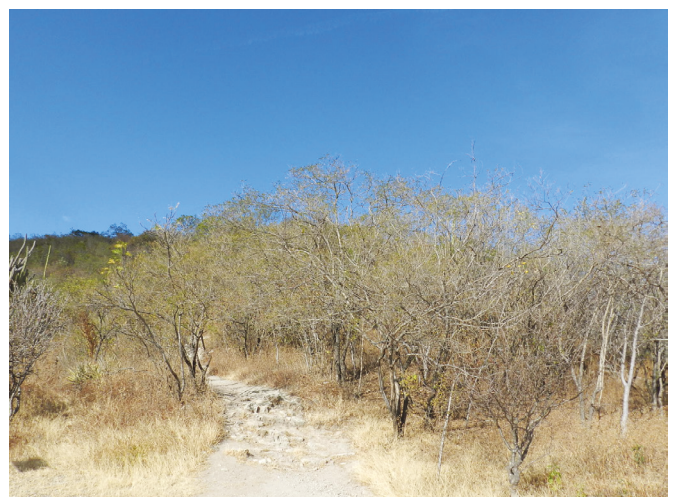
FIGURE 2. Thorn woodland habitat occupied by Sceloporus smithi in the vicinity of Hierve El Agua, Municipality of San Lorenzo Albarradas, Oaxaca, México.