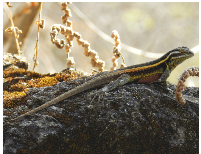
FIGURE 1. Adult male Sceloporus smithi CIB 4184, SVL 63 mm, from Hierve El Agua, Municipality of San Lorenzo Albarradas, Oaxaca, México.

Sceloporus smithi has been reported to be associated with granitic rock formations in subhumid habitats throughout the dry Pacific lowlands within the Isthmus of Tehuantepec region of southeastern México. It was previously reported to have an elevational limit of 1000