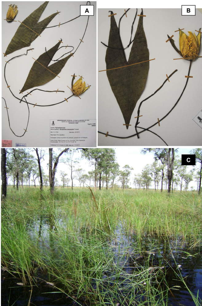
FIGURE 1. A - Nymphaea belophylla specimen n. 30920, kept in Herbarium CGMS, collected in the Pantanal wetland at Porto Esperança, Corumbá, Mato Grosso do Sul, Brazil. B - Detail of leaf and flower. C - Plant habitat in the floodable savanna.

on the apex with 20 cm long, to 7 cm wide, with acicular sclereides; flowers with sepals and petals in distinct whorls of four; sepals ca. 5-6 cm long and 2 cm wide, green, oblong-ovate; petals shorter than sepals, the inner ca. 2.6-3.2 cm long and 1.3-1.8 cm wide, creamy and light yellow; the outermost stamens ca. 3.0 cm long, creamy and light yellow; carpelar appendices ca. 1.3 cm long, cream-colored to light yellow. The collected specimens were kept in the Herbarium CGMS (UFMS) under the record numbers CGMS-30919 (G.A. Amador 234) and CGMS-30920 (G.A. Amador 235). New collection records are necessary for better characterization and documentation of N. belophylla .