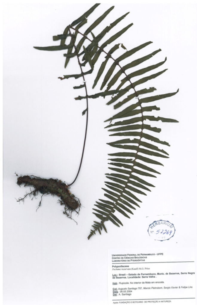
FIGURE 1. Specimen of Pecluma recurvata (Kaulf.) M.G. Price, collected in Serra Negra, Bezerros (Pernambuco, Brazil). UFP 57264 (Santiago et al. 757).

Rhizome long-creeping, 5-8 mm diam., scales with narrow-triangular, light red-brow, non-lustrous, basifixed or basally cordate, margins papillate; Fronds 55-57 cm long, spaced ca. 0,5 cm or less apart on the rhizome; Stipe 11-16 cm long, red-brow, with acicular hairs; Blades narrow-triangular; Rachis red-brow; Segments 3-6 cm long, 3-5 mm wide, perpendicular or slightly ascending to