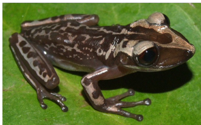
FIGURE 1. Adult male of Aparasphenodon bruno from the municipality of Ilhéus, state of Bahia, Brazil.

The specimens were euthanized with lidocaine 2% (Xylocaína®), fixed in 10% formalin and preserved in 70% ethanol, and deposited in the Coleção de Anfíbios da Universidade Estadual do Sudoeste da Bahia, Vitória da Conquista (UESB) and Museu de Zoologia da Universidade Estadual de Santa Cruz (MZUESC). The collecting permit was issued by the Instituto Chico Mendes de Conservação da Biodiversidade (ICMBIO) (Permanent License 13708-1 and 12394-2).