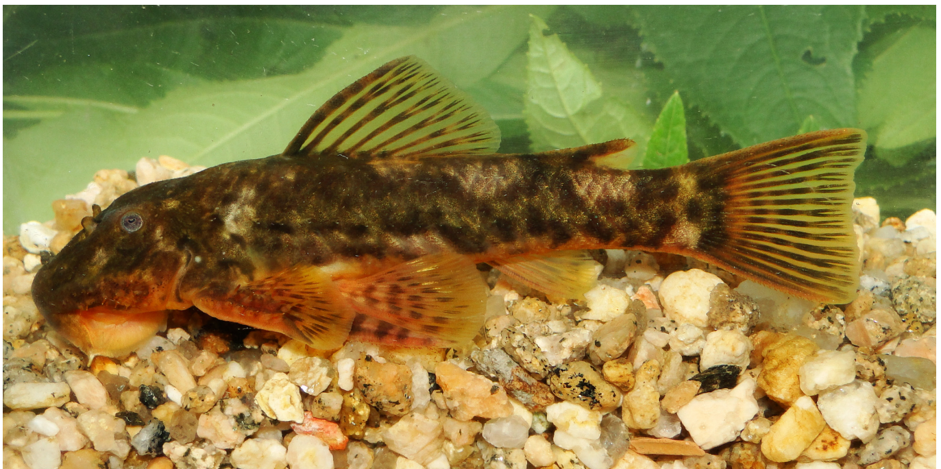
FIGURE 2. Live male of Pareiorhaphis garbei , UFRN 1025, 82.92 mm SL, captured in São João river basin, Rio de Janeiro state, Brazil.

Although in the previous known localities P. garbei was found in high altitudes, usually above 800 m (Lazzarotto et al. 2007; Pereira and Brito 2008), its altitudinal range was between 1090 to 269 m, with lower altitudes in the Guanabara Bay river basins (269 m in Santo Aleixo river and 410 m in Guapi/Macacu river basin, Table 1). In the