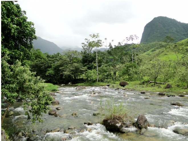
FIGURE 3. Sampling site of Pareiorhaphis garbei in São João river basin, Environmental Protection Area of Bacia do Rio São João, Silva Jardim, Rio de Janeiro state, Brazil.

Both coastal and inland streams located in areas adjacent to the presently know distribution of P. garbei are in an advanced degradation state, and pressures over the conservation units are increasingly stronger. Due to its limited distribution and anthropogenic alterations over its natural habitat, the conservation status of P. garbei still brings concern even with its occurrence confirmed in four conservation units and the distribution expansion disclosed herein. The presence of P. garbei restricted to a single tributary in São João river basin, adjacent to headwaters of Macaé river basin, where the species also occurs may be due to a river capture as result of erosive processes in the coastal slope of the Serra do Mar mountains (Ribeiro 2006; Ribeiro et al. 2006; Menezes et al. 2008; Backup 2011). Ongoing phylogeographic studies with P. garbei will shed light in the processes involved in the current geographic distribution and will contribute to conservation measures of this threatened armoured suckermouth catfish.