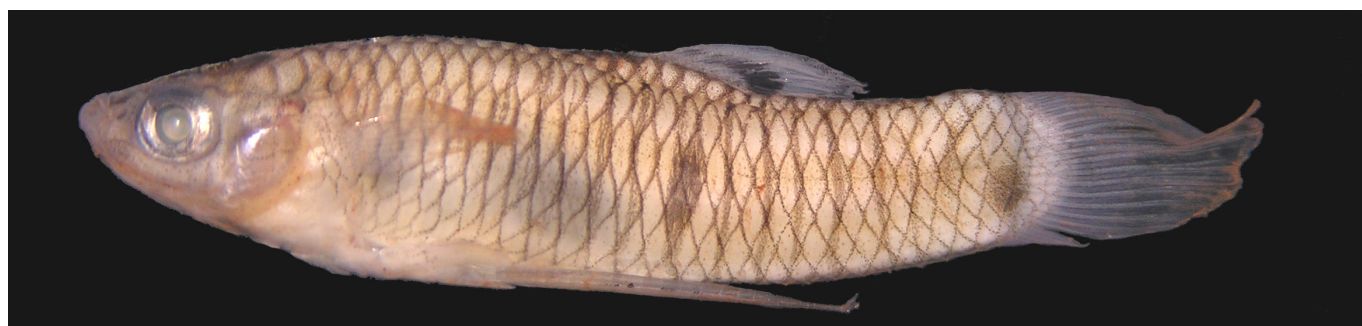
FIGURE 1. Phalloceros spiloura , male, 19.5 mm, UFRGS 17827, Divinéia stream, Municipality of Tapera, Rio Grande do Sul State, Brazil.

The specimens collected were examined and identified as Phalloceros spiloura due to the presence of three autapomorphies cited by Lucinda (2008), namely: the rounded spot located on the lower half of the caudal peduncle close to the base of lowest caudal-fin rays present in all specimens (Figure 1), a patch of dark pigmentation on the last anal-fin rays present in all females, and the halves of gonopodial paired appendix straight and perpendicular