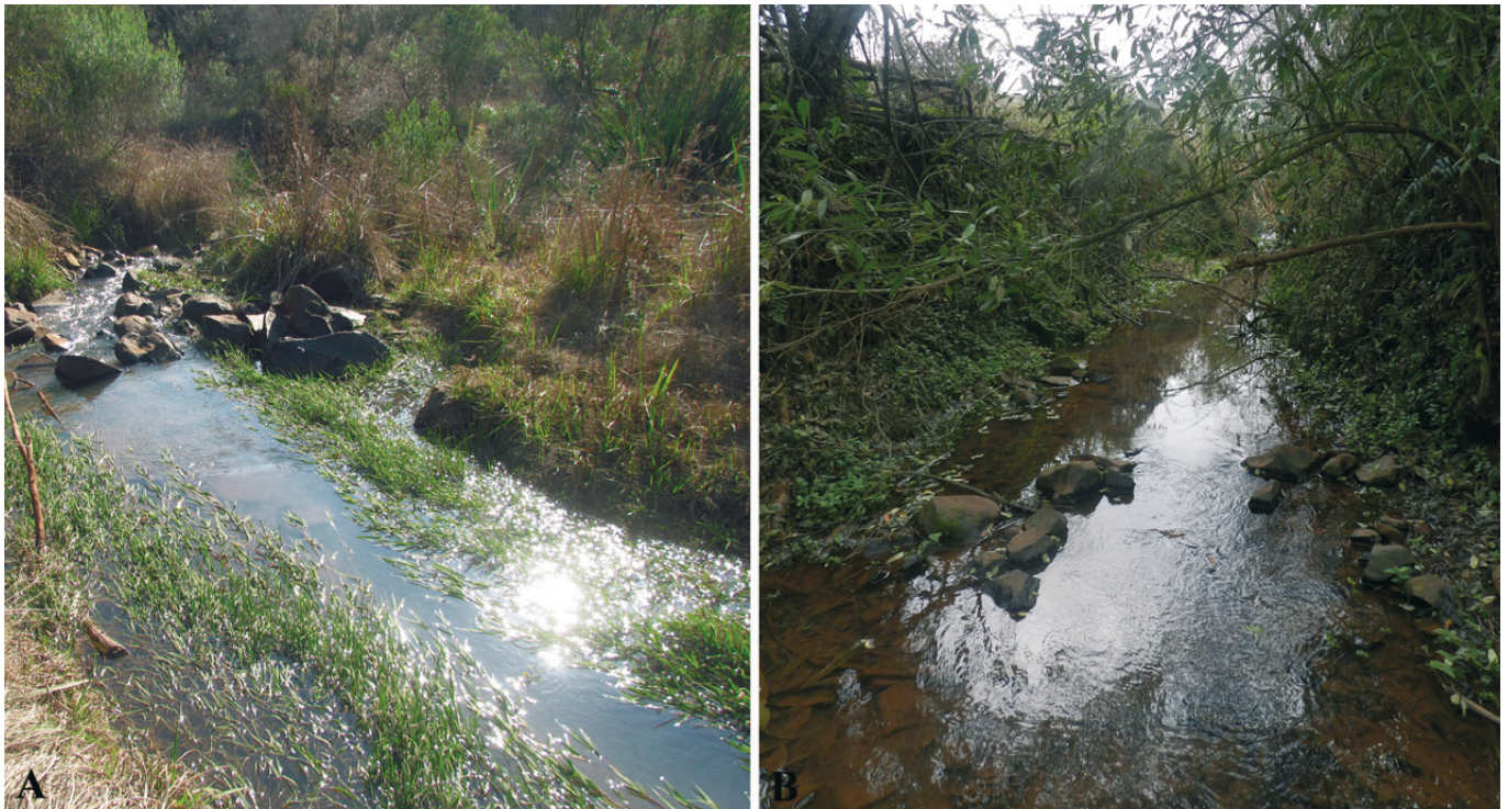
FIGURE 4. Angico stream (A) and Divinéia stream (B), Municipality of Tapera, Rio Grande do Sul State, Brazil.