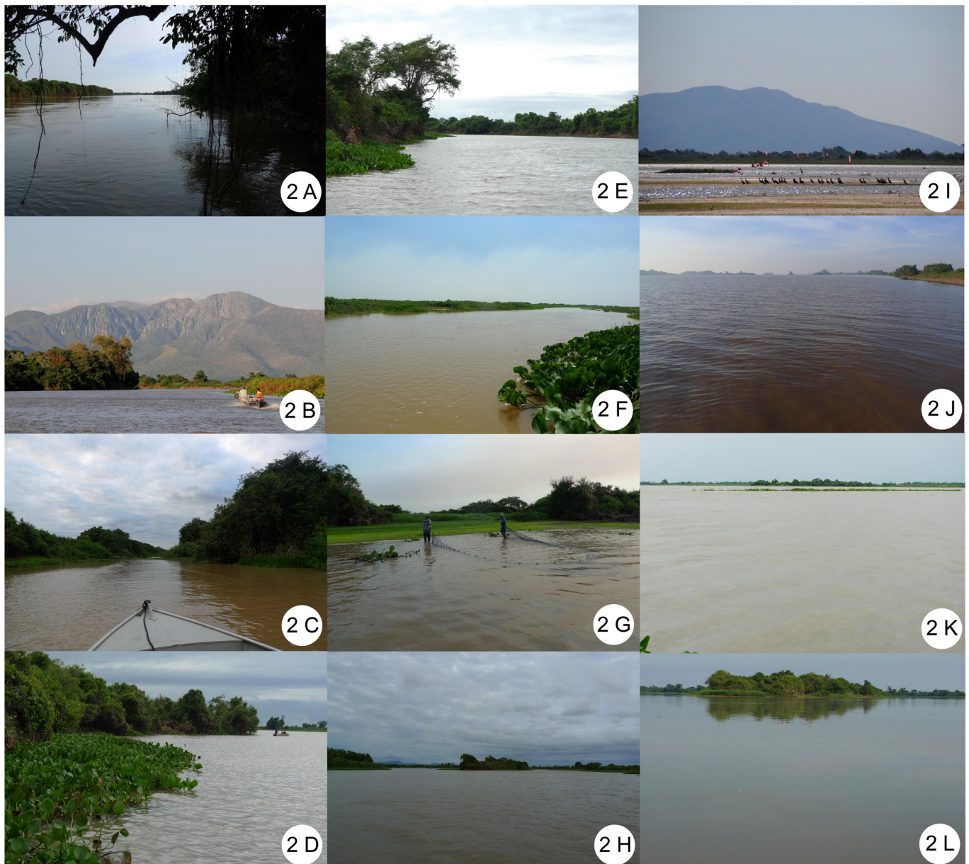
FIGURE 2. Sampled localities in the Parque Nacional do Pantanal Matogrossense, upper Paraguai River basin, Brazil. See Table 1 for detailed locality information.

The specimens were counted and sacrificed in a solution of clove oil (Eugenol, 2 drops per liter; cf. American Veterinary Medical Association 2001). After that, the fish were fixed in 96% ethanol (for molecular studies) or 10% formalin solution (for morphological studies) and then preserved in 70% ethanol. Large specimens or those in poor conditions were not deposited in museums. Muscle tissues were collected and preserved in 96% ethanol to support later genetic analyses (voucher specimens were also preserved). Species identifications were performed consulting the taxonomic literature and identification keys (Britski et al. 1999; 2007; Costa 2011; Ferraris 2007; Géry 1977; Lucena 2003; 2007; Malabarba 2004; Souza-Filho and Shibatta 2007; Vari 1991; 1992a, b). Specimens that were not identified to species level were not inventoried to avoid accidentally listing a species twice. We used