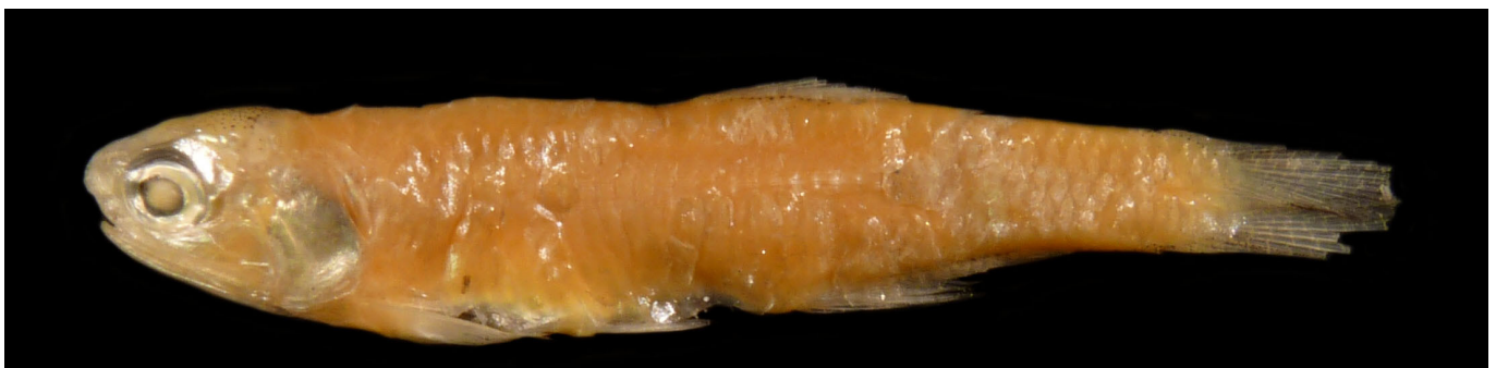
FIGURE 3. Specimen of Anchoviella sp., LBP 13692, 38.9 mm in total length, collected at corixo Bigueirinho in the PNPM, upper Paraguai River basin, Brazil.