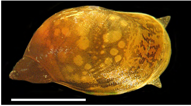
FIGURE 3. Dorsal view of Pseudosuccinea columella from Tres Palmeras, Salta province, Argentina. Scale bar: 5 mm.

ACKNOWLEDGMENTS: This study was supported by grant #1850 of the National University of Salta Research Council and by grant #PICT 00031 of the Agencia Nacional de Promoción Científica y Tecnológica (ANPCYT).