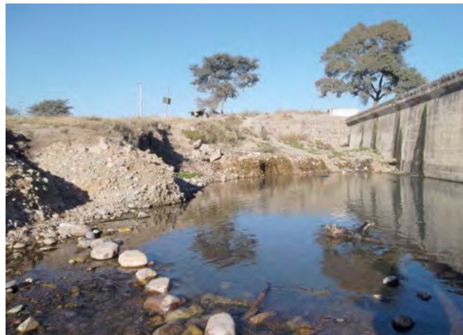
FIGURE 2. Collection site of Pseudosuccinea columella in Tres Palmeras, Salta province, Argentina (24°47'41.03" S, 65°28'04.18" W).

A total of 98 specimens of Pseudosuccinea columella were collected and found to share their habitat with a population of Physa sp. Pseudosuccinea columella shells are oval in shape, had a short spire with a pointed apex, a