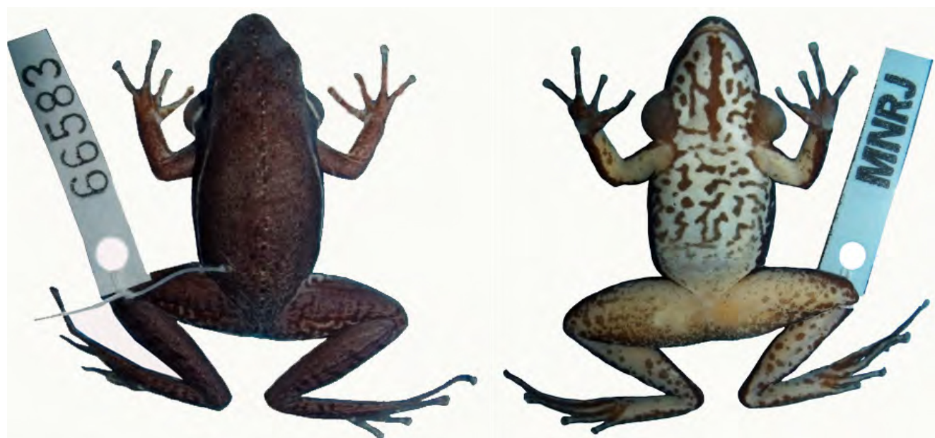
FIGURE 1. Dorsal (left) and ventral (right) views of preserved specimen of Hylodes lateristrigatus (MNRJ 66583) from the Serra das Torres mountains, Espírito Santo, Brazil.

On 20 September 2009, an adult male Hylodes lateristrigatus (Figure 1; SVL = 36.5 mm) was collected by two of us (JCFO and EP) in a stream at the region of Serra das Torres (21°00'51.33" S, 41°13'45.02" W; datum: WGS84; 730 m elevation), in Atílio Vivacqua, Espírito Santo (collection permit # 19743-2/2009 granted by SISBIO/IBAMA). The individual was found during a herpetofaunal survey, and collected by hand. Identification of the specimen as H. lateristrigatus was based on some characteristics such as the ventral pattern, the lack of dark transverse bars on the hind legs, and the thin white labial stripe (Salles et al. 2012;