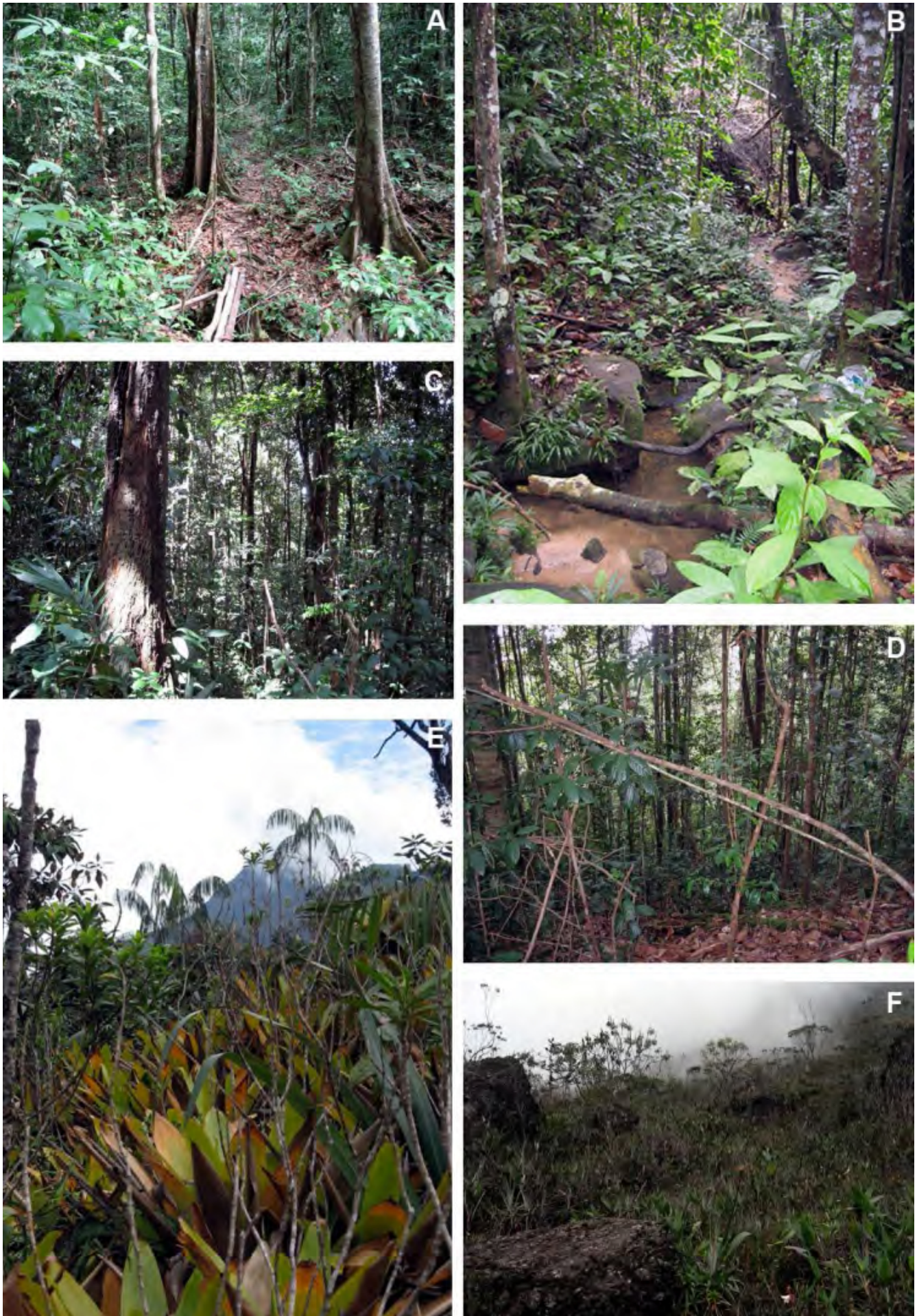
FIGURE 2. Aspect of the vegetation at the altitudes sampled at the Pico da Neblina: A – 100 m; B – 400 m; C – 860 m; D – 1,550 m; E – 2,000 m and F – 2,400 m.