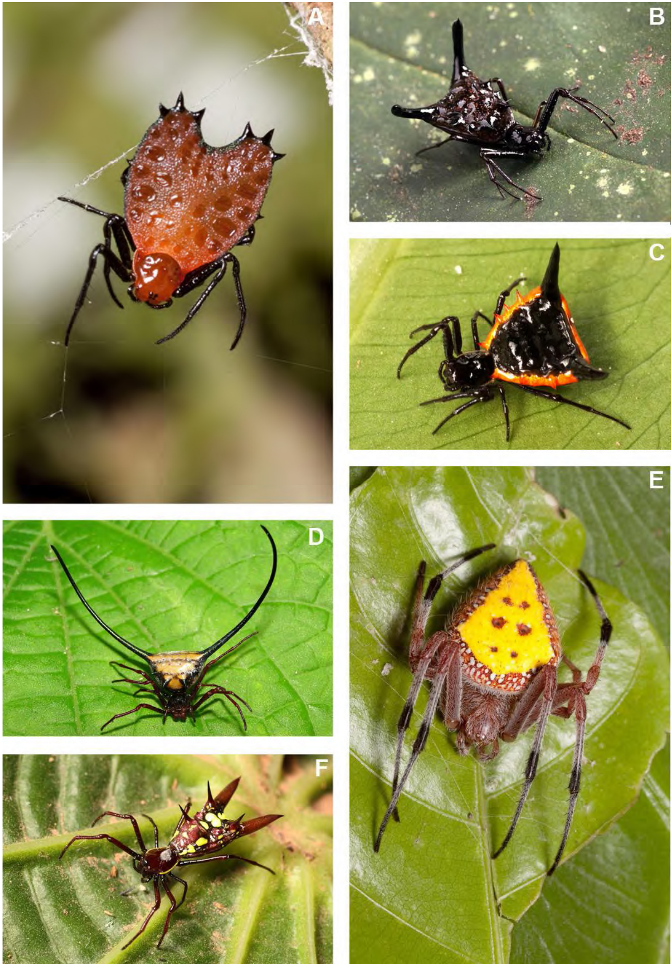
FIGURE 3. Spiders recorded at the Pico da Neblina. Species of the family Araneidae. A – Micrathena clypeata ; B – Micrathena embira ; C – Micrathena pungens ; D – Micrathena cyanospina ; E – Eriophora nephiloides ; F – Micrathena spinosa . With the exception of M. cyanospina , specimens photographed are not from the Pico da Neblina.