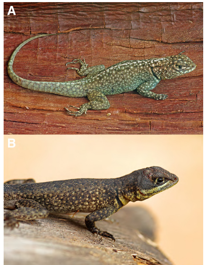
FIGURE 1. (A) Tropidurus callathelys (CHUNB 74538, SVL = 87 mm) and (B) T. chromatops (CHUNB 74553, SVL = 75 mm) at Parque Estadual Serra Ricardo Franco, Vila Bela da Santíssima Trindade, Mato Grosso, Brazil.

land in eastern Bolivia and western Brazil; approximately 5,300 km 2 lie in Bolivia and the remainder is in Brazil, where it is called Serra de Ricardo Franco (Litherland and Power 1989). The Brazilian portion is elongated, approximately 150 km long and 50 km wide, with a