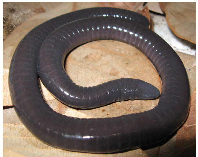
Figure 2. Siphonops paulensis (C00378).

de Pessoal de Nível Superior (CAPES) for fellowships. We also thank the anonymous reviewer for comments and suggestions in this manuscript.