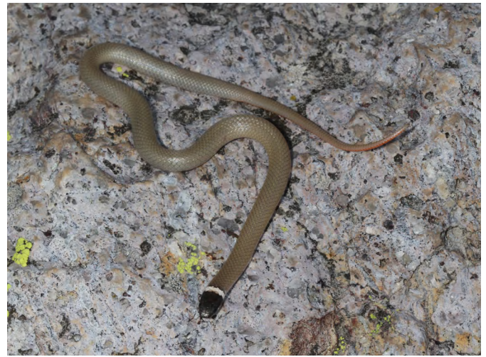
Figure 2. Juvenile of Tantilla wilcoxi (UAACV-R 264) found at 2.9 km SE from the specimen LSUDPC 8018.

Together the new records fill a distributional gap for Tantilla wilcoxi between the states of San Luis Potosí and Aguascalientes (Figure 3). The three specimens found are from two localities 2.9 km from each other, and together extend the range of this species ca. 38 km (in a straight line) southeast from Tepezala, Aguascalientes, 71 km (in a straight line) southwest from 1.5 mi (by road) east San Luis Potosí