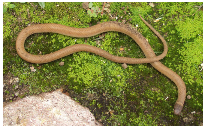
Figure 1. Adult male of Tantilla wilcoxi (LSUDPC 8018), from Ojuelos de Jalisco, Jalisco México.

During a field trip on July 2009, we (RACM, JCAM and ZYGS) found an adult specimen of T. wilcoxi in a rock crevice in the foothills of Mesa Las Preñadas plateau, municipality of Ojuelos de Jalisco, ca. 3 km SW of Las Negritas, Asientos, Aguascalientes (21.962267° N, 101.891364° W, WGS84; 2,200 m elevation). Four years later on July 2013, CMGB returned to the same locality and found an adult male of T. wilcoxi (Figure 1) at ca. 12:30 h inactive beneath a Sotol plant ( Dasyllirion acrotrichum ) along with a lizard Sceloporus spinosus . However, because we mistakenly assigned this locality to the state of Aguascalientes rather than Jalisco, while we were doing the herpetological surveys, we released both specimens immediately after photos were taken. Photo vouchers were subsequently submitted to the La Sierra University Digital Photo Collection (LSUDPC 8018 and 8019).