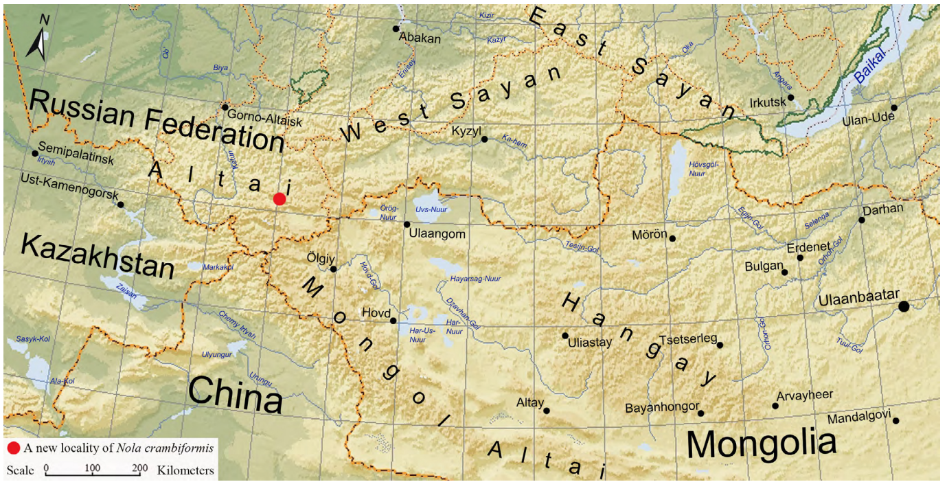
Figure 8. Map of a new locality of Nola crambiformis .