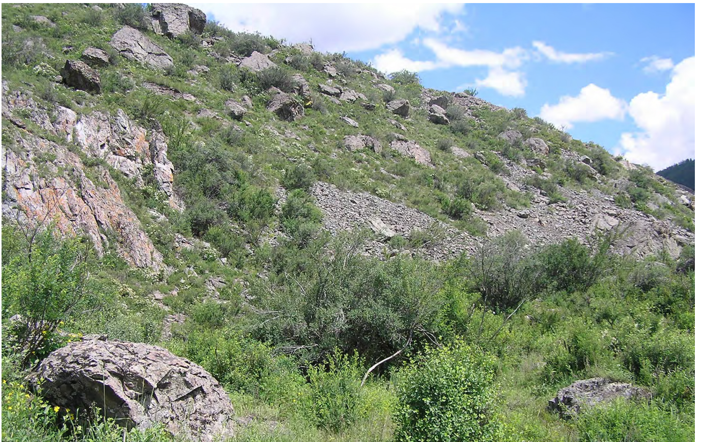
Figure 9. Russia, Altai Republic, Ulagan district, Aigulaksky Ridge, vicinity of Aktash village, 1,400 m, 50°19' N, 087°35' E, the habitat of Nola crambiformis .