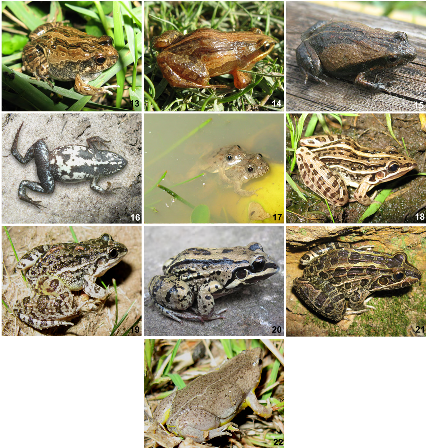
Figure 2. Continued. 13) Physalaemus biligonigerus , 14) Physalaemus henselii , 15) and 16) Physalaemus riograndensis (dorsal and ventral view respectively), 17) Pseudopaludicola falcipes , 18) Leptodactylus gracilis , 19) Leptodactylus latinasus , 20) Leptodactylus mystacinus , 21) Leptodactylus latrans , 22) Elachistocleis bicolor .

as priority for conservation with confirmed presence in Cerro Verde are L. latrans , M. montevidensis , P. bibroni and O. maisuma . As they were not found during this study in the area, the species A. siemersi and C. ornata were considered as potential priorities for conservation.