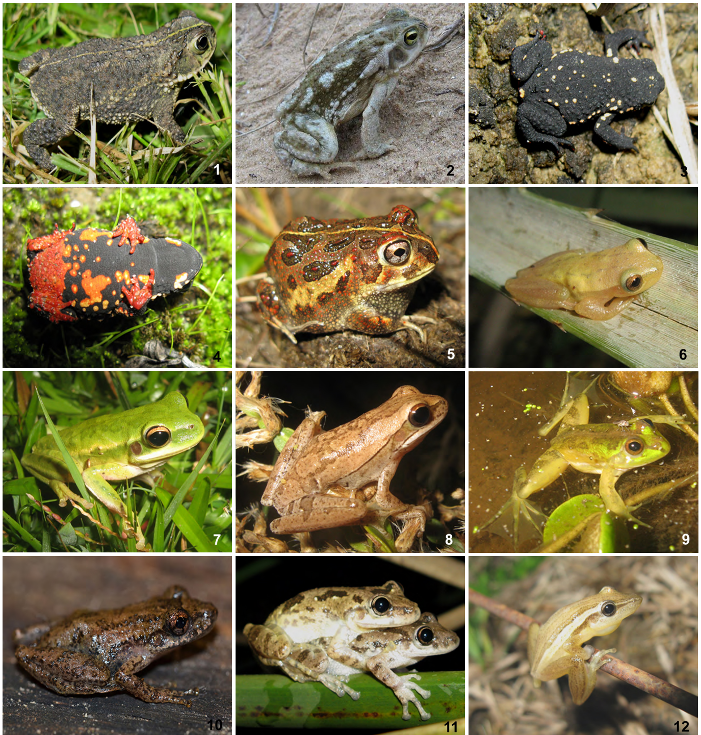
Figure 2. Species found during nocturnal surveys in Cerro Verde. 1) Rhinella dorbignyi , 2) Rhinella arenarum , 3) and 4) Melanophryniscus montevidensis (dorsal and ventral view respectively), 5) Odontophrynus maisuma , 6) Dendropsophus sanborni . 7 and 8) Hypsiboas pulchellus (green and brown individuals respectively), 9) Pseudis minutus , 10) Scinax berthae , 11) Scinax granulatus , 12) Scinax squalirostris .

The conservation status of the 23 species is presented in Table 2. At a national level, the threatened