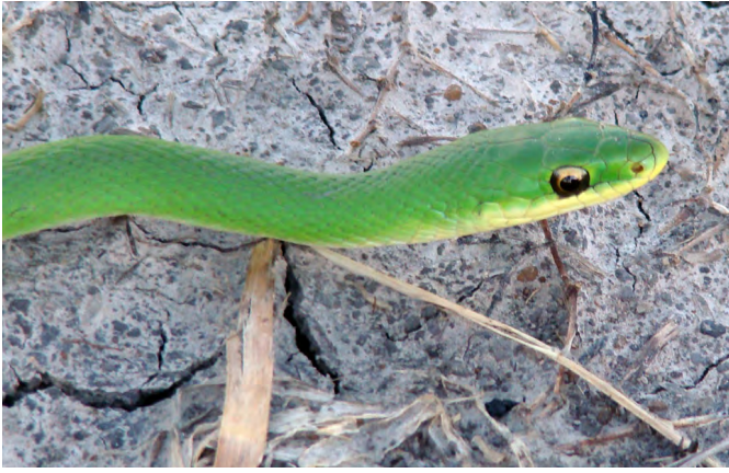
Figure 27. Erythrolamprus guentheri .