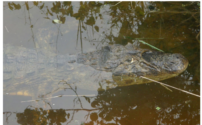
Figure 3. Caiman latirostris .