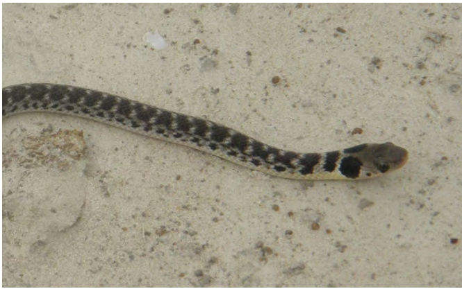
Figure 16. Erythrolamprus poecilogyrus . Juvenile.