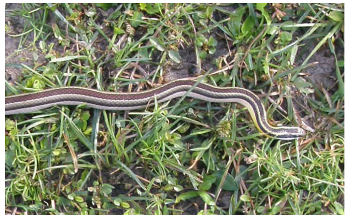
Figure 26. Lygophis dilepis .