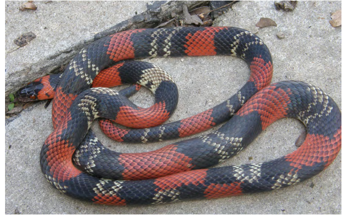
Figure 29. Oxyrhopus guibei .