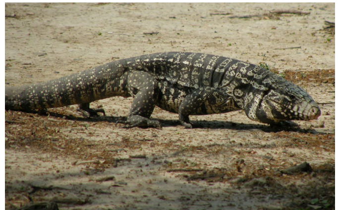
Figure 41. Tupinambis merianae . Adult.

Habitat: terrestrial and arboreal. Observed in forest, grassland clearings, around human settlements, as well as