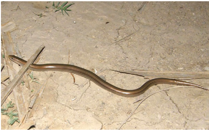
Figure 6. Ophiodes intermedius .