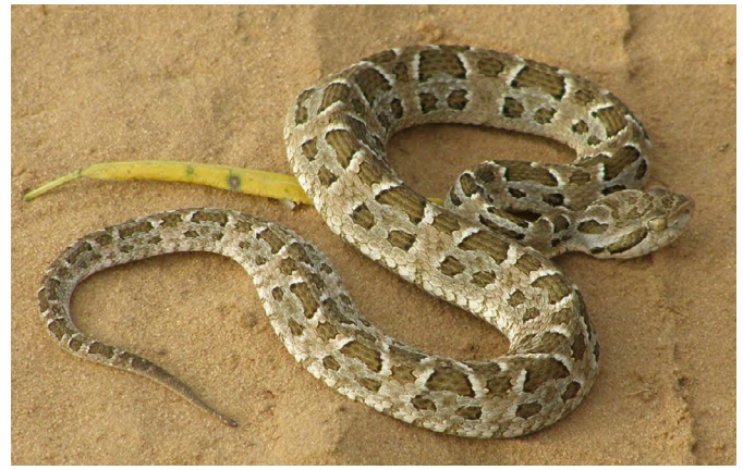
Figure 44. Bothrops diporus .