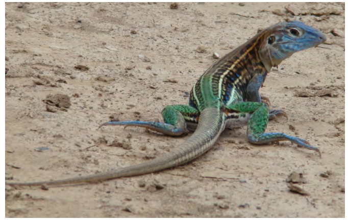
Figure 39. Teius teyou . Reproductive male coloration.