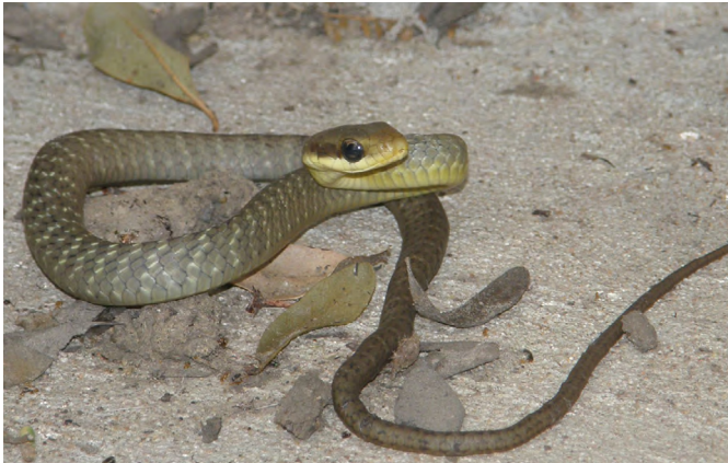
Figure 11. Chironius quadricarinatus maculoventris . Juvenile.