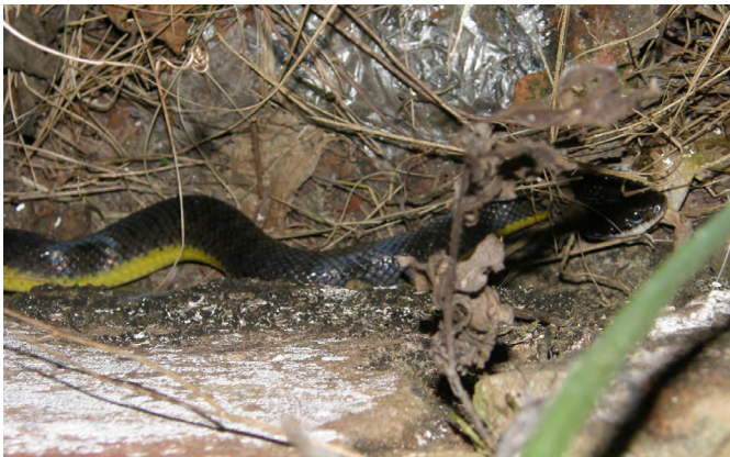
Figure 17. Erythrolamprus poecilogyrus . Adult.