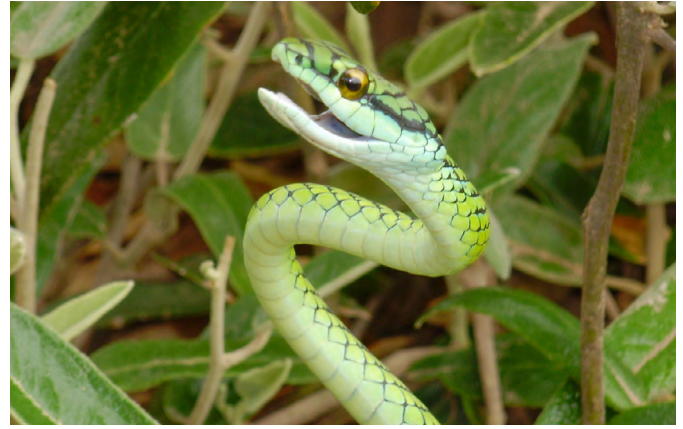
Figure 23. Leptophis ahaetulla marginatus .