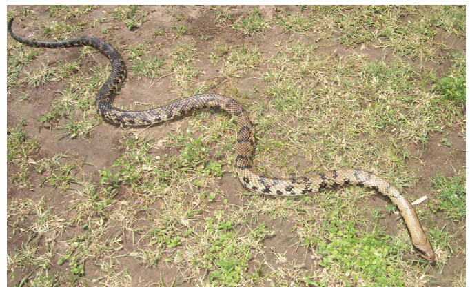
Figure 20. Hydrodynastes gigas .

National status: not threatened (Lavilla et al. 2000).