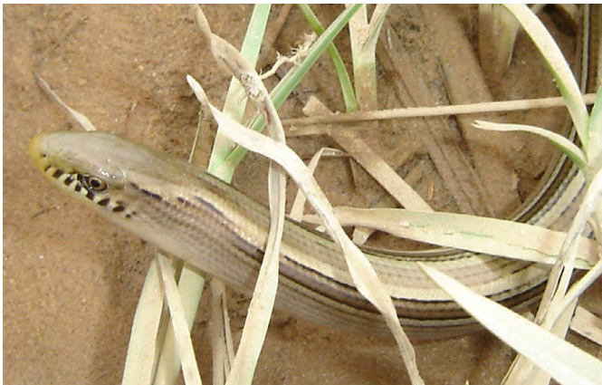
Figure 7. Ophiodes intermedius .