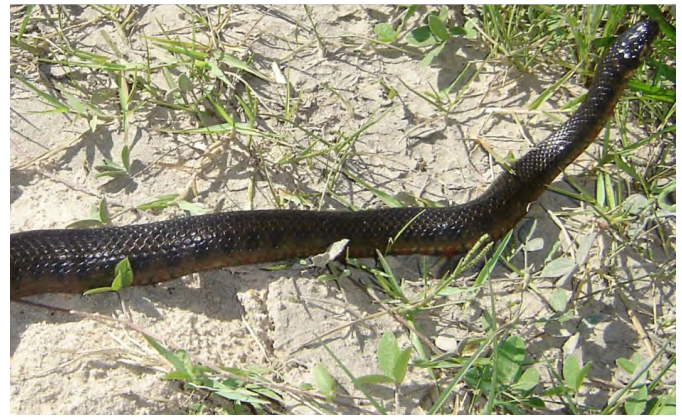
Figure 18. Helicops leopardinus .