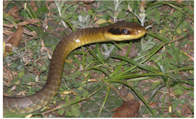
Figure 12. Chironius quadricarinatus maculoventris . Adult.