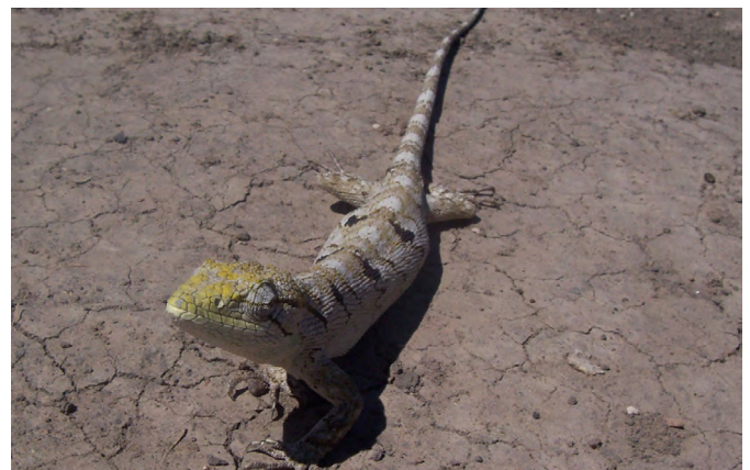
Figure 35. Polychrus acutirostris .

National status: not threatened (Lavilla et al. 2000).