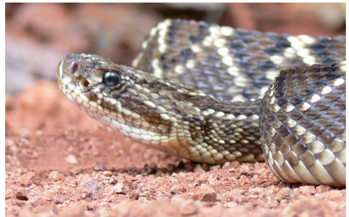
Figure 46. Crotalus durissus terrificus .

Behavior: We observed this species feeding on small mammals, lizards and reptiles.