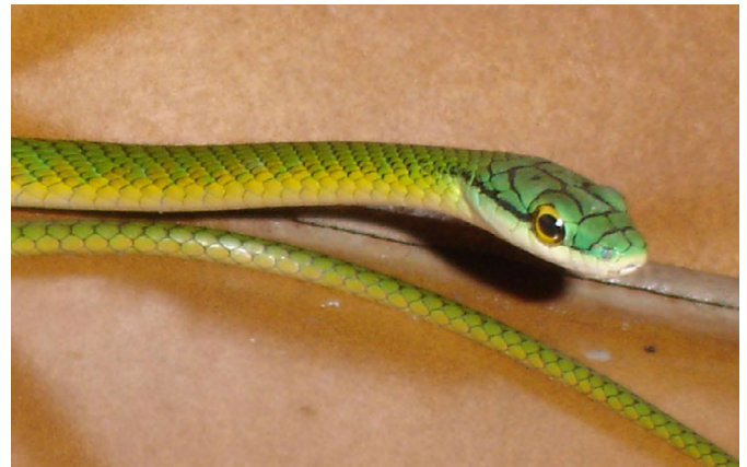
Figure 24. Leptophis ahaetulla marginatus .

former “Zanjita” ranger station, Estero Poi and open areas near “Estero Poi” ranger station.