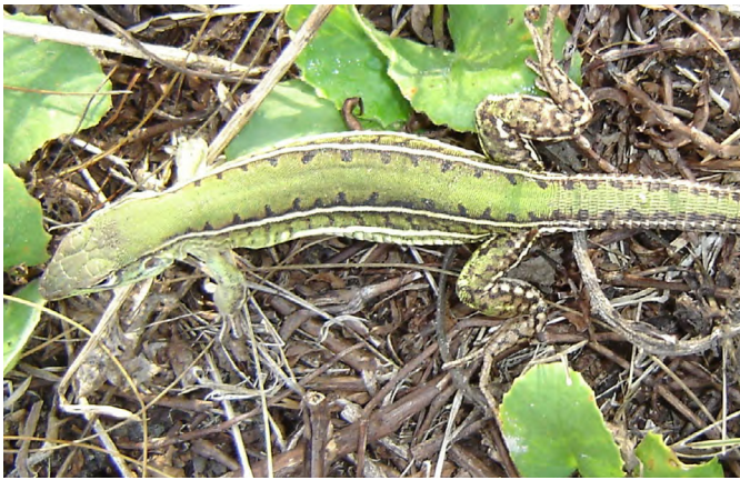
Figure 37. Teius oculatus .