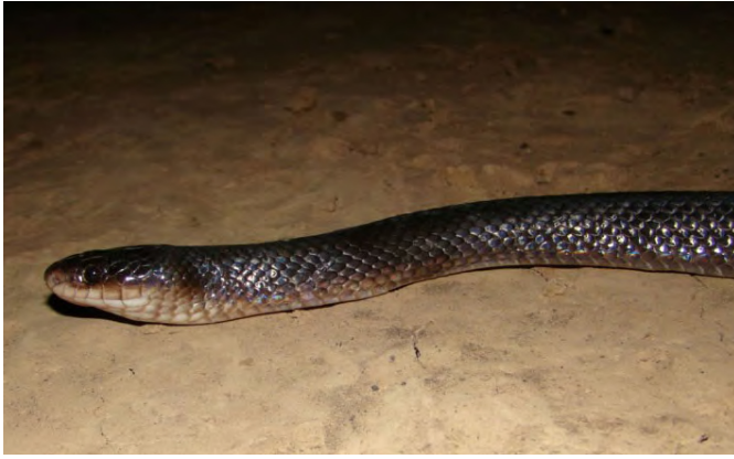
Figure 10. Boiruna maculata .