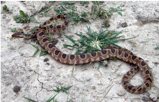
Figure 22. Leptodeira annulata pulchriceps .