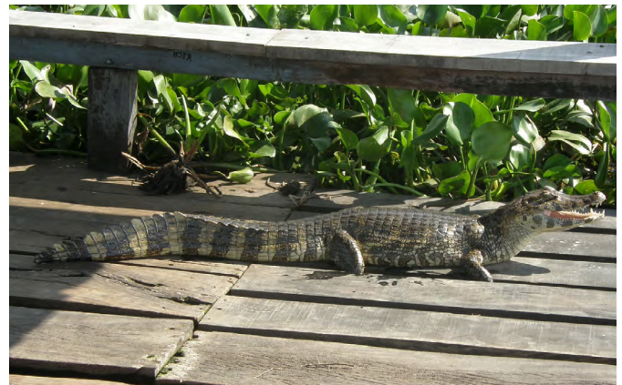
Figure 4. Caiman yacare . Juvenile.