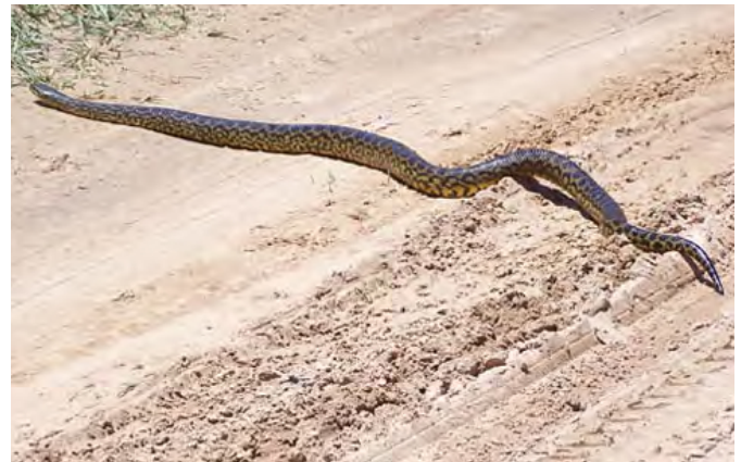
Figure 9. Eunectes notaeus . Adult.

night, and their margins during the day.