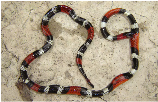
Figure 33. Micrurus pyrrhocryptus .