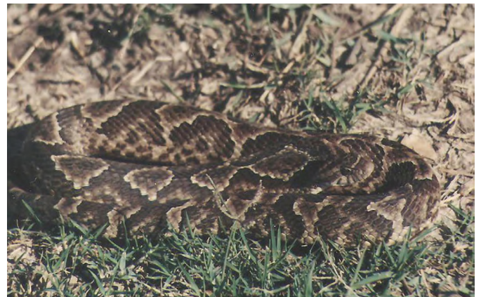
Figure 32. Xenodon merremii .