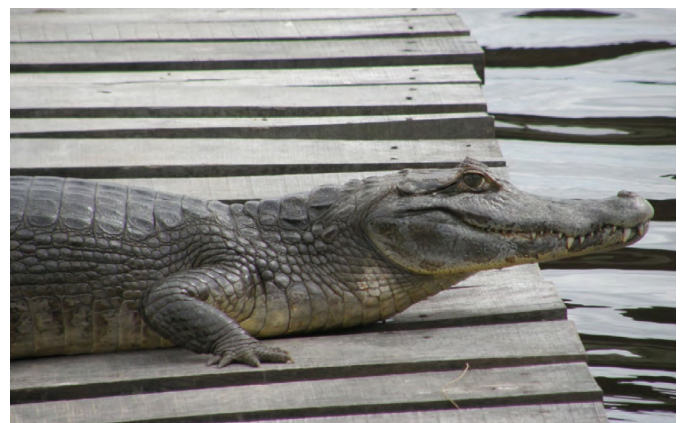
Figure 5. Caiman yacare . Adult.