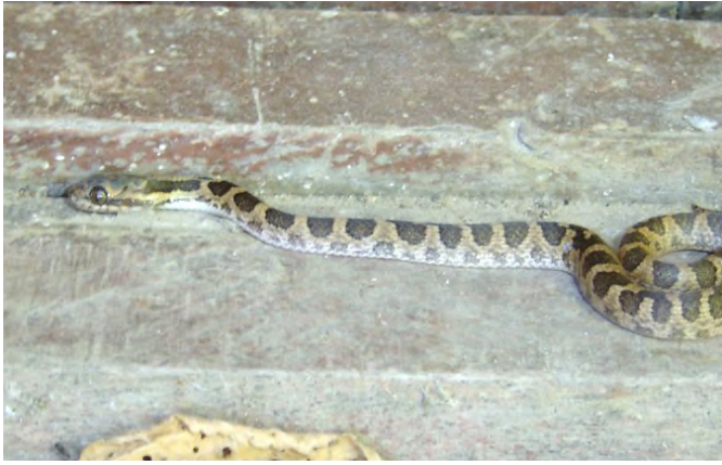
Figure 21. Leptodeira annulata pulchriceps .