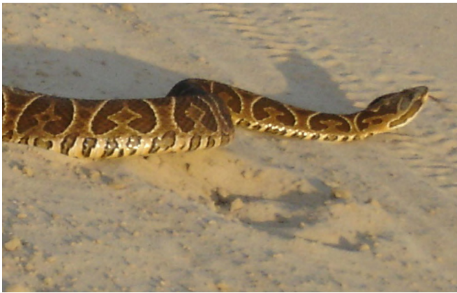
Figure 43. Bothrops alternatus .