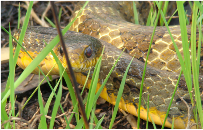
Figure 28. Mastigodryas bifossatus .