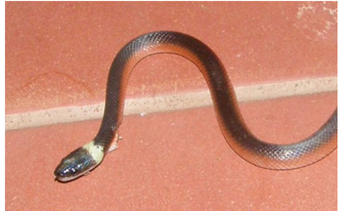
Figure 13. Clelia bicolor . Juvenile.