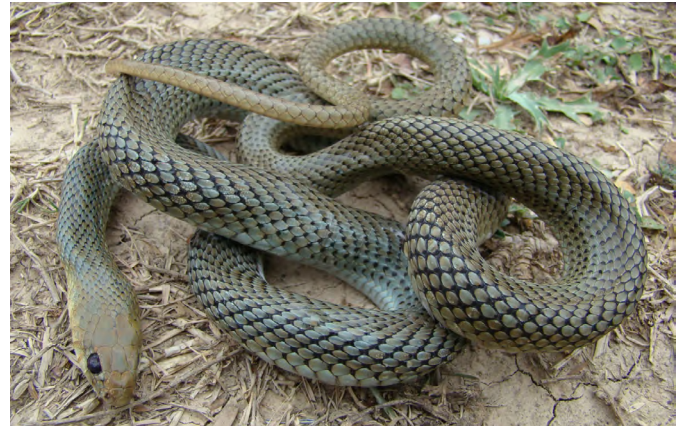
Figure 30. Philodryas patagoniensis .