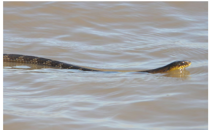
Figure 19. Hydrodynastes gigas .