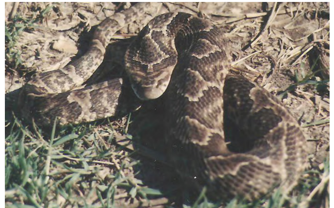
Figure 31. Xenodon merremii .

National status: not threatened (Lavilla et al. 2000).