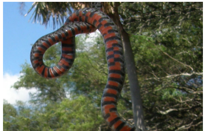
Figure 15. Erythrolamprus almadensis . Ventral.