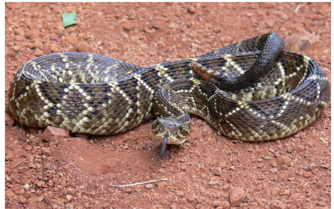
Figure 45. Crotalus durissus terrificus .

Comments: previously reported from RPNP by Chebez et al. (2005).