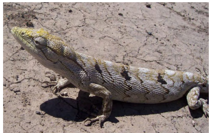
Figure 36. Polychrus acutirostris .