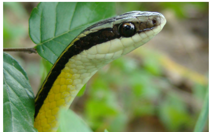
Figure 25. Lygophis dilepis .

National status: not threatened (Lavilla et al. 2000).