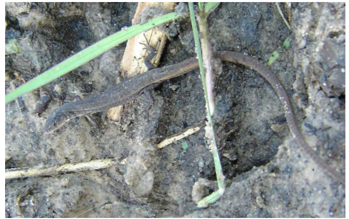
Figure 34. Cercosaura schreibersi .