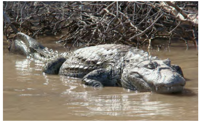
Figure 2. Caiman latirostris .