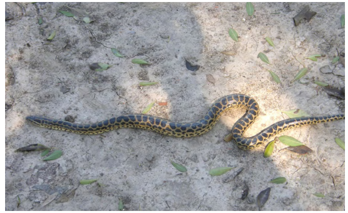
Figure 8. Eunectes notaeus . Juvenile.