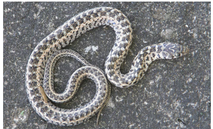
Figure 14. Erythrolamprus almadensis .

Habitat: terrestrial. Observed in grasslands, generally