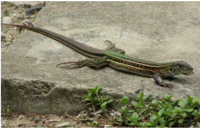
Figure 38. Teius teyou . Normal coloration.