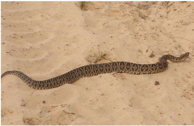
Figure 42. Bothrops alternatus .