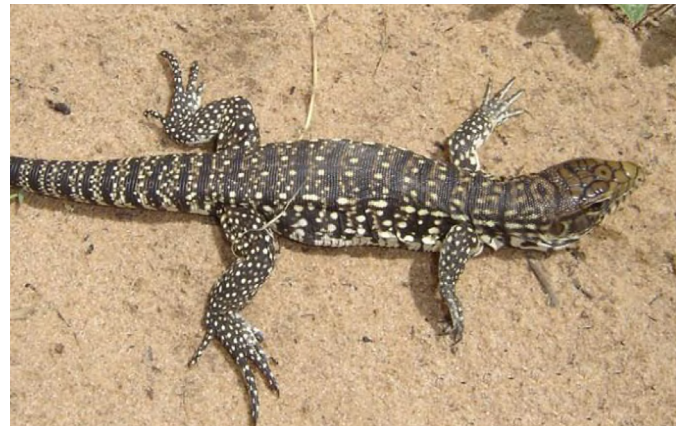
Figure 40. Tupinambis merianae . Juvenile, Photo by D. Cano.