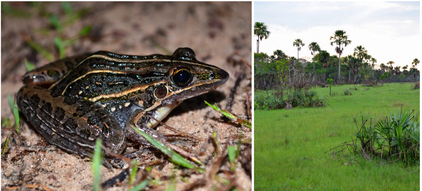
Figure 1. Left: An adult male of Leptodactylus sertanejo from Parque Estadual do Mirador, Maranhão, northeastern Brazil. Right: Habitat where the individual was collected.

L. jolyi , L. marambaiae Izecksohn, 1976, and L. plaumanni Ahl, 1936 by presenting longitudinal skin folds on the dorsal surface of the shanks, and is distinguished by its moderate size and its call (Giaretta and Costa 2007; de Sá et al. 2014). The specimen was diagnosed by its snout-vent length (SVL) of 51 mm and by its advertisement call (Figure 2) non-pulsed with dominant frequency varying from 2153–2325 Hz (mean 2325 Hz; SD = 84.05), emitted at rates of 1–16 calls/minute. Call duration varies from 17.48–22.97 ms (mean 20.11 ms; SD = 1.52; n = 15 notes), separated by internote intervals varying between 422.4 and 7095 ms (mean 2535 ms; SD = 2025; n = 15 notes).