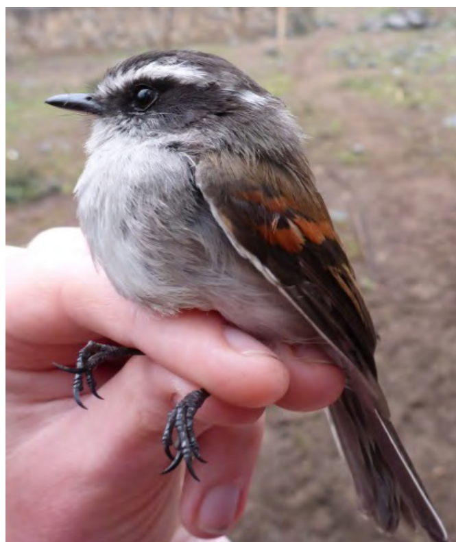
Figure 3. Ochthoeca piurae (MSB:Bird: 43588), captured at Viquil.

population viability, (2) it would have long-term value to biodiversity science as a multi-part specimen with complete data and frozen tissues (Rocha et al. 2014), and (3) we were able to do so legally under permit 0280-2014-MINAGRI-DGFFS/DGEFFS. EBO dissected and prepared the specimen, which was a female of undetermined age (skull 100% ossified, ovary 5x2 mm, no Bursa of Fabricius, moderate fat). The skin and tissue is deposited at CORBIDI (Lima, Peru), with duplicate tissue sample to be cryopreserved at the University of New Mexico Museum of Southwestern Biology (Albuquerque, NM, USA). The specimen catalog number is MSB:Bird:43588 and its complete data can be found at this permanent URL: http://arctos.database.museum/guid/MSB:Bird:43588 . We examined specimens of O. piurae and its close relative, O. leucophrys , from the Museum of Southwestern Biology (MSB). O. leucophrys is larger (male; =14.1 g, S.D.=1.0, n=16 ; female; \bar{x}=13.9 g, S.D.=2.7, n=16 ) compared to O. piurae (male; 9.0 g, n=1 ; female; \bar{x}=8.8 g, S.D.=0.1, n=4 ).