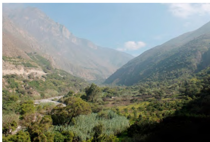
Figure 2. Typical habitat at Viquil.

population viability, (2) it would have long-term value to biodiversity science as a multi-part specimen with complete data and frozen tissues (Rocha et al. 2014), and (3) we were able to do so legally under permit 0280-2014-MINAGRI-DGFFS/DGEFFS. EBO dissected and prepared the specimen, which was a female of undetermined age (skull 100% ossified, ovary 5x2 mm, no Bursa of Fabricius, moderate fat). The skin and tissue is deposited at CORBIDI (Lima, Peru), with duplicate tissue sample to be cryopreserved at the University of New Mexico Museum of Southwestern Biology (Albuquerque, NM, USA). The specimen catalog number is MSB:Bird:43588 and its complete data can be found at this permanent URL: http://arctos.database.museum/guid/MSB:Bird:43588 . We examined specimens of O. piurae and its close relative, O. leucophrys , from the Museum of Southwestern Biology (MSB). O. leucophrys is larger (male; =14.1 g, S.D.=1.0, n=16 ; female; \bar{x}=13.9 g, S.D.=2.7, n=16 ) compared to O. piurae (male; 9.0 g, n=1 ; female; \bar{x}=8.8 g, S.D.=0.1, n=4 ).