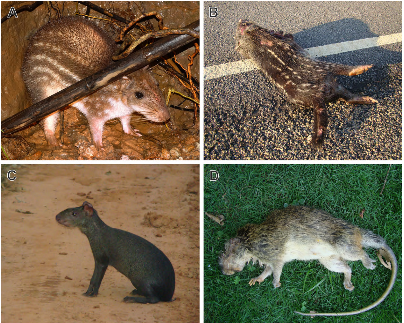
Figure 4. Species of rodents (Cuniculidae, Dinomyidae, Dasyproctidae and Echimyidae) recorded at ESEC do Rio Acre and RESEX Chico Mendes: (A) Cuniculus paca , (B) Dinomys branickii , (C) Dasyprocta fuliginosa , and (D) Dactylomys boliviensis .

and long pelage, a short incisive foramen (4.18 mm long), the absence of an alisphenoid strut, and the absence of capsular process on lateral face of mandibular ramus. Specimens of Hylaeamys perenensis (Allen, 1901) (Figure 3C), did not present the parafoselet on the second upper molar, the roof of mesopterygoid fossa is completely ossified, and the cranial dimensions are large (greatest skull length ranging from 34.45 to 35.41 mm and length of upper molar tooththrow ranging from 5.15 to 5.26 mm). In the genus Neacomys , we recognized two species: Neacomys musseri Patton, da Silva, and Malcolm, 2000 and Neacomys spinosus (Thomas, 1882). The specimen of N. musseri has very small corporeal and cranial dimensions (greatest skull length = 19.65 mm and length of upper molars w = 2.42 mm; Figure 6B) and presents the derived carotid and stapelial circulatory pattern (pattern 2; Voss 1988). Alternatively, specimens of N. spinosus (Figure 3D) showed large corporeal and cranial dimensions (greatest skull length ranging from 22.81 to 24.71 mm and length of upper molar tooththrow