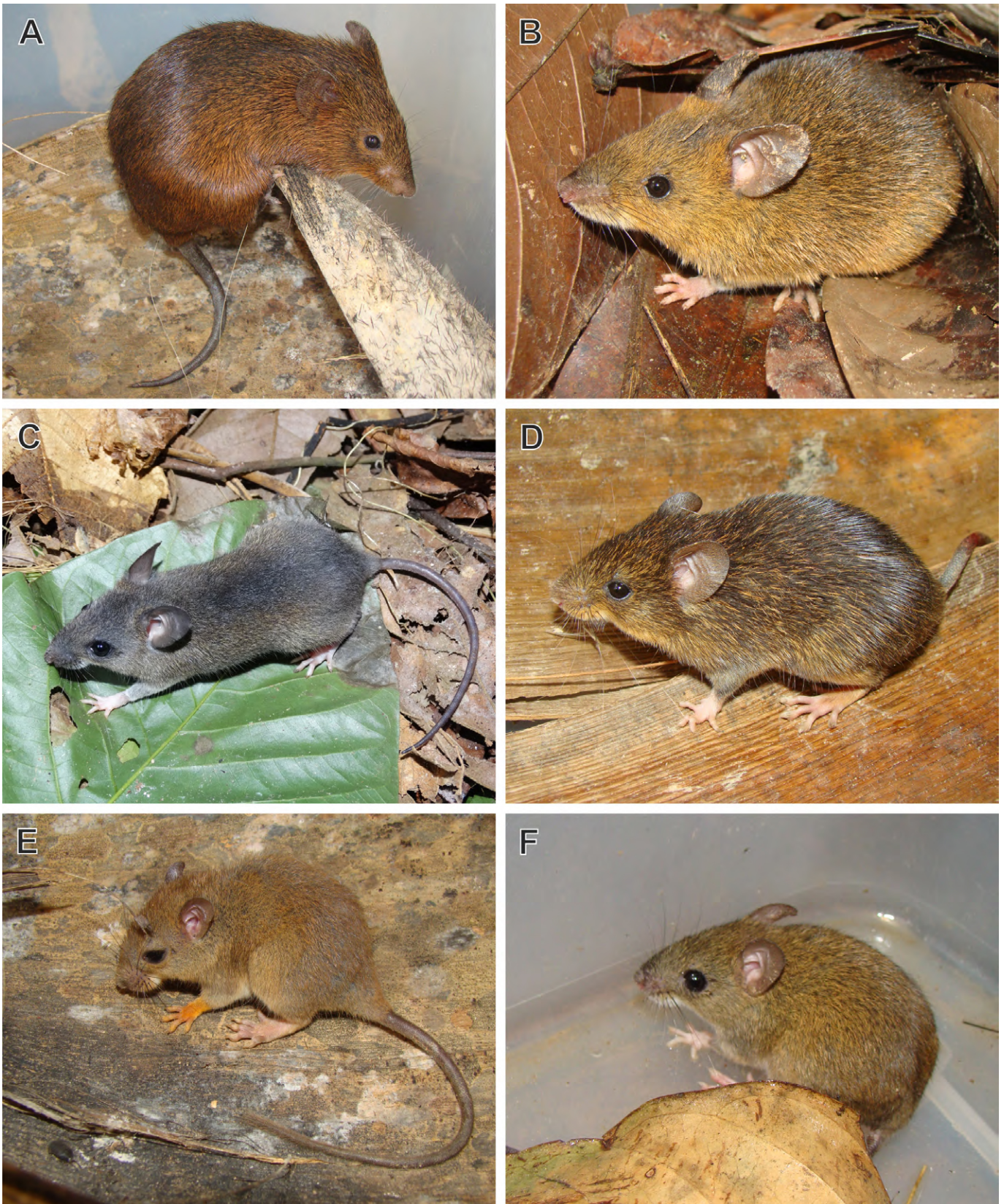
Figure 3. Species of rodents (Cricetidae) recorded at ESEC do Rio Acre and RESEX Chico Mendes: (A) Oxymycterus inca , (B) Euryoryzomys macconnelli , (C) Hylaeamys perenensis , (D) Neacomys spinosus , (E) Oecomys bicolor , and (F) Oligoryzomys microtis .