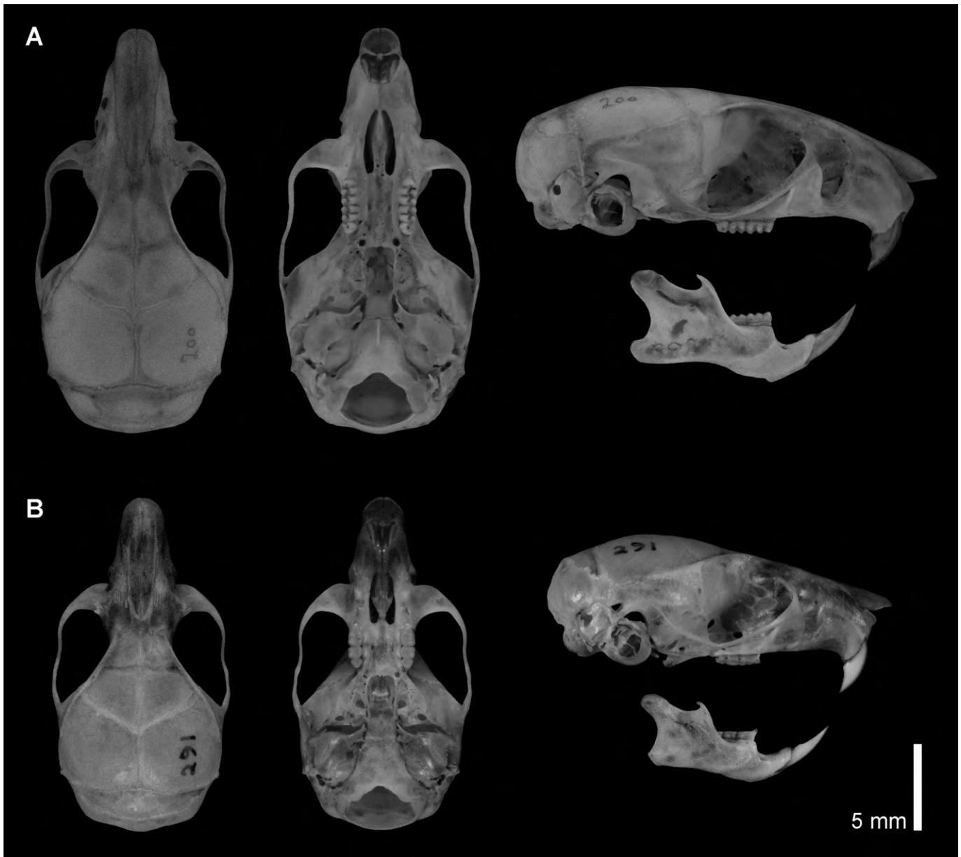
Figure 6. Skull and mandible of (A) Neacomys spinosus (LMUSP 200; ♀; greatest skull length = 23.41 mm) and (B) Neacomys musseri (LMUSP 291; ♂; greatest skull length = 19.65 mm). Skull on dorsal, ventral, and lateral view, and mandible on lateral view.

are brown hairs present. The skull (Figure 7B) presents a long rostrum with long rostral tube, the incisive foramen is mostly ovoid, and the mesopterygoid fossa surpasses the anterior margin of third molar. Proechimys simonsi Thomas, 1900 has the longest tail of the three species (almost same length of head and body combined) and is distinctly bicolored (dark brown on dorsal surface and white on ventral surface). The dorsum of the pes is covered by white hairs. The skull (Figure 7C) presents a long rostrum with long rostral tube, the incisive foramen is clearly ovoid and short, and the mesopterygoid fossa surpasses the anterior margin of third molar. All young specimens of this genus were treated as Proechimys sp. because of the plasticity of morphological features in this age class.