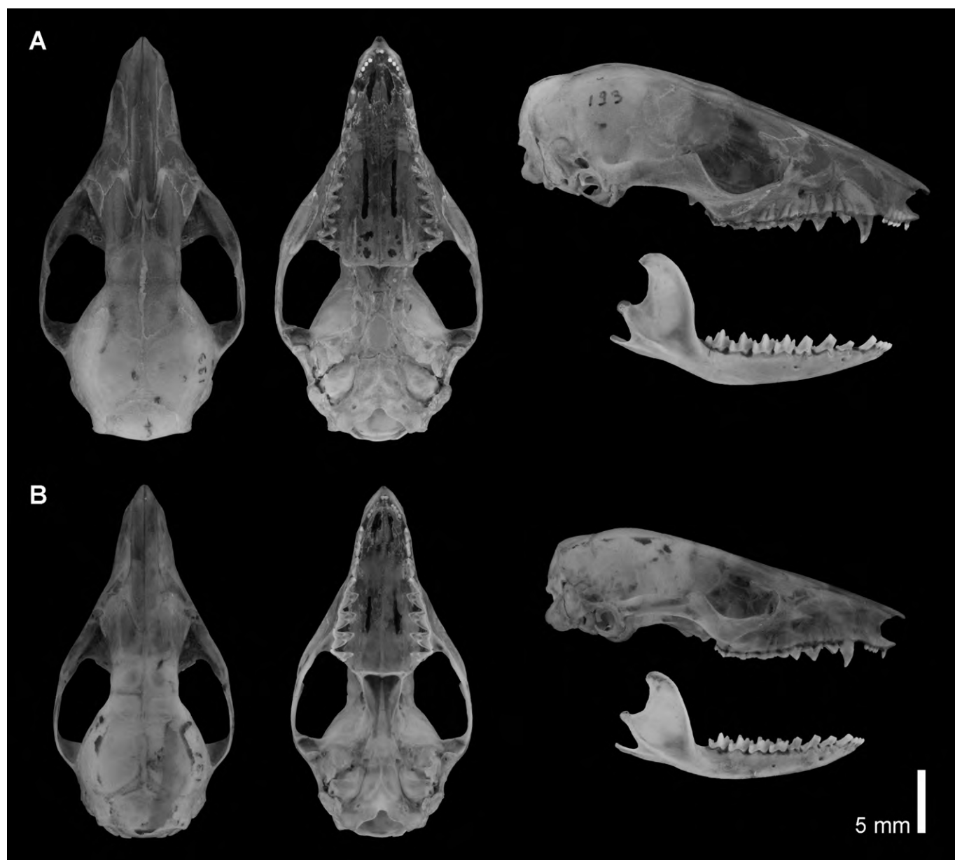
Figure 5. Skull and mandible of (A) Marmosops noctivagus (LMUSP 193; ♂; greatest skull length = 32.50 mm) and (B) Marmosops bishopi (LMUSP 191; ♂; greatest skull length = 28.53 mm). Skull on dorsal, ventral, and lateral view, and mandible on lateral view.

Regarding the genus Oligoryzomys , we identified Oligoryzomys microtis (Allen, 1916) from the upper Rio Acre specimens (Figure 3F). Specimens presented yellowish light brown dorsal coloration. Ventrally the pelage is grayish white (hairs with basal portion gray and apical portion white) with pure white patches (hairs entirely white) on the gular and inguinal regions. The tail is relatively short and no longer than the combined head and body length.