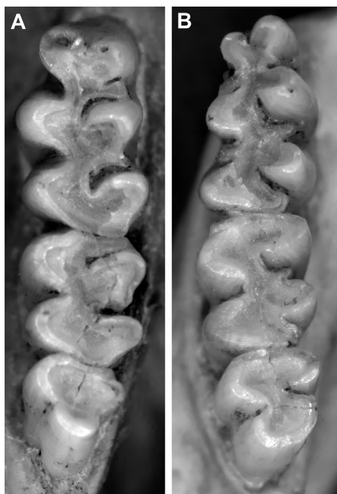
Figure 9. Upper (A) and lower (B) molar series, in occlusal view, of Oxy-mycterus inca (LMUSP 187).

Of the 25 species recorded here, 18 are small mammal species, according to the classification adopted, for example, by da Silva et al. (2007), Hice and Velazco (2012), and Lopes and Mendes-Oliveira (2015), who considered as small mammals the representatives of the families Didelphidae, Cricetidae, and Echimyidae. Comparing our results with other inventories of nonvolant small mammals throughout Amazon, the richness obtained here is greater than reported for PARNA Tapajós, in Pará (12 species; George et al. 1988), and similar to the richness reported from the region of the middle Rio Madeira, in Amazonas state (19 species; da Silva et al. 2007). However, the upper Rio Acre is notably less rich in nonvolant small mammals when compared to other sites, such as the upper Rio Juruá, Acre (28 species; Patton et al. 2000), the region of Paracou, French Guiana (27 species; Voss et al. 2001); the Reserva Nacional Allpahuayo-Mishana, Loreto, Peru (28 species; Hice