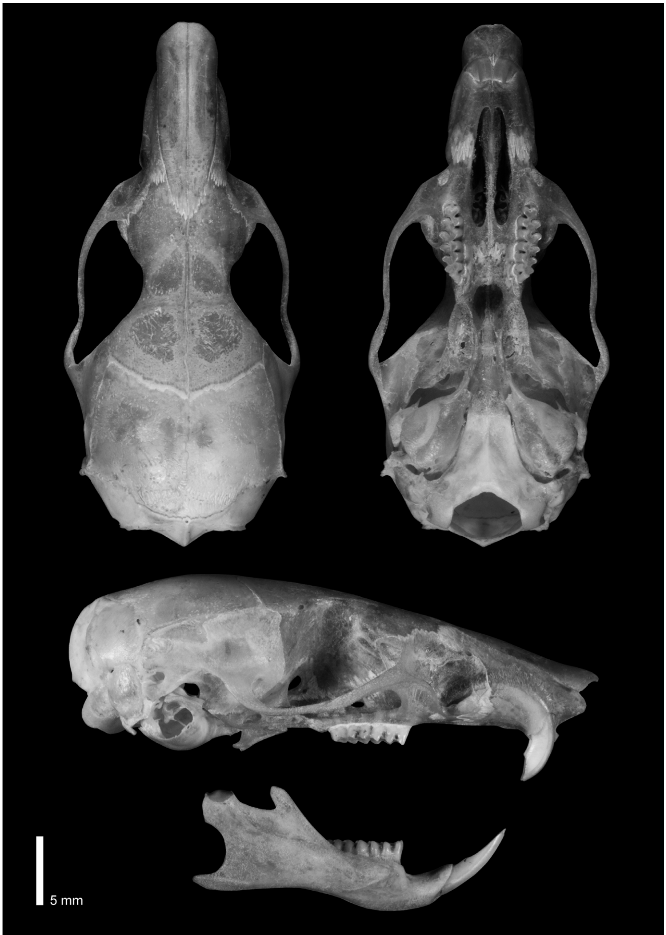
Figure 8. Skull and mandible of Oxymycterus inca (LMUSP 188; ; greatest skull length = 38.54 mm). Skull on dorsal, ventral, and lateral view, and mandible on lateral view.