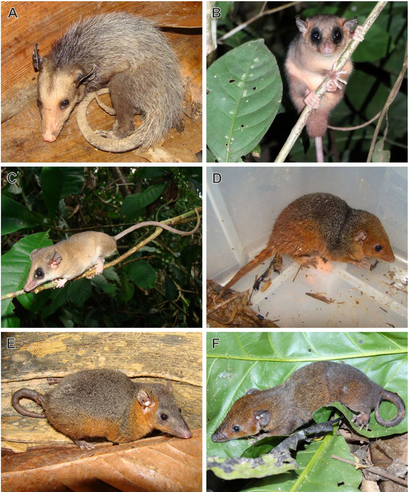
Figure 2. Species of marsupials (Didelphidae) recorded at ESEC do Rio Acre and RESEX Chico Mendes: (A) Didelphis marsupialis , (B) Marmosa regina , (C) Marmosops bishopi , (D) Monodelphis emiliae , (E) Monodelphis glirina , and (F) Monodelphis sp.