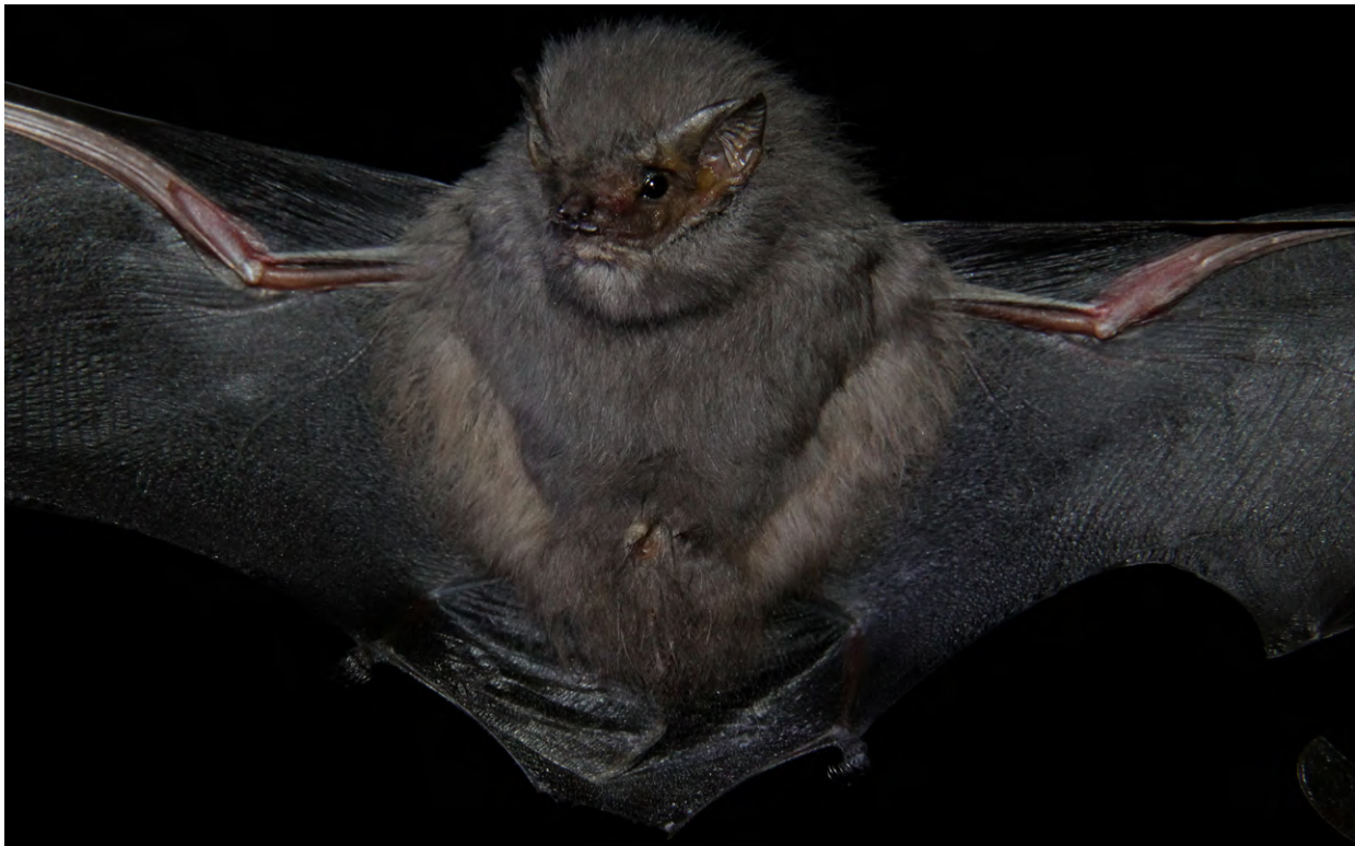
Figure 2. Individual of Cyttarops alecto collected at Casanare River, Finca La Providencia, vereda La Manga in Hato Corozal, Casanare Department (ICN 21911).