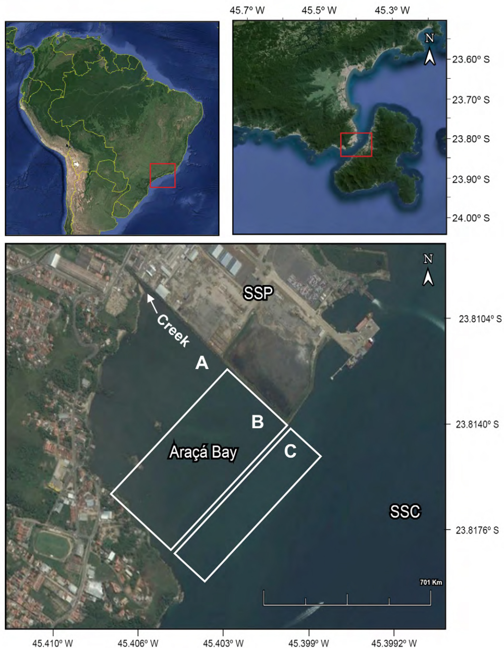
Figure 1. Map of the Araçá Bay at the continental margin of the São Sebastião Channel (SSC), northern coast of São Paulo, Brazil. The arrow indicates Mãe Isabel Creek. São Sebastião Island (SSI); São Sebastião Port (SSP). A: intertidal; B: shallow sublittoral; C: outer sublittoral.

the islets to the bay's mouth is of 1.16 \pm 0.53 m. The bay's configuration prevents it from being directly influenced by the relatively strong SSC hydrodynamics, thus, the main abiotic driver in the bay is the tide (Amaral et al. 2010; Gubitoso et al. 2008).