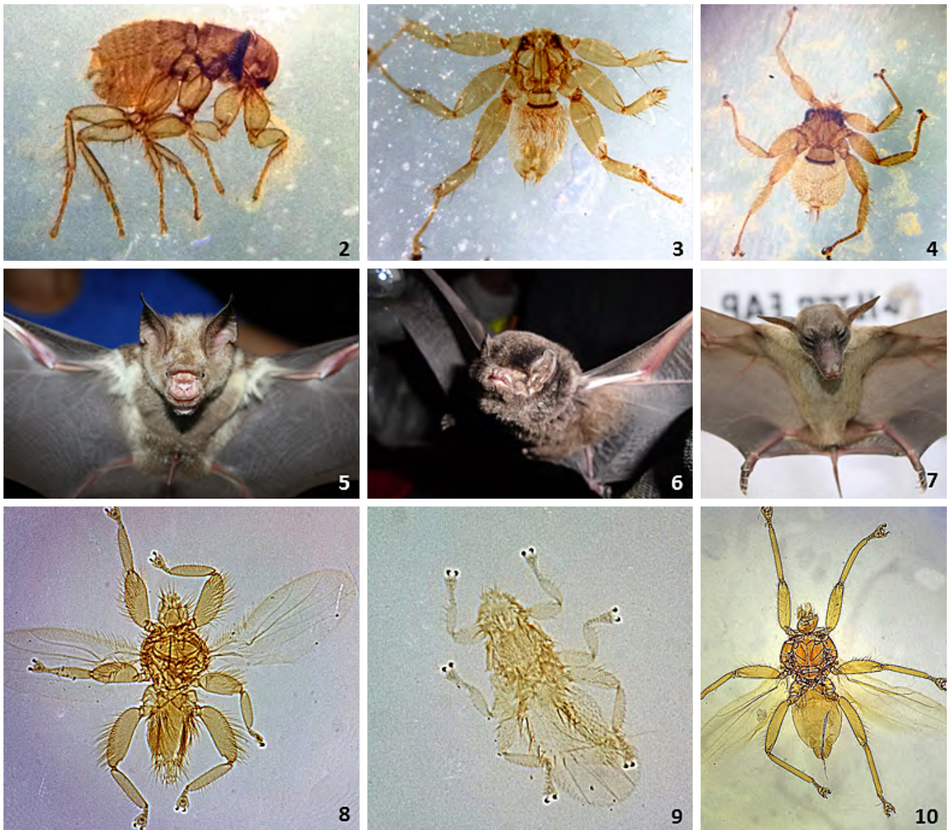
Figures 3–9. Some ectoparasitic arthropods, and bat hosts, from Marinduque Island, Philippines. 2. Thaumapsylla breviceps Rothschild, bat flea found in fruit-eating bats. 3. Nycteribiid bat fly Eucampsipoda sundaica . 4. Nycteribiid bat fly Nycteribia parvula . 5. Bat host Hipposideros diadema . 6. Bat host Miniopterus schreibersii . 7. Bat host Rousettus amplexicaudatus . 8. Streblid batfly, Brachytarsina amboinensis . 9. Streblid batfly, Raymondia pseudopagodarum . 10. Streblid batfly, Megastrebla parvior .

occur in the Philippines (MAA 1962; THEODOR 1963; CUY 1980b). In this paper, four genera were recorded: Eucampsipoda (Figure 3), Nycteribia (Figure 4), Penicillidia , and Phthiridium . Eucampsipoda is exclusively associated with Pteropodidae (MAA 1962) whereas the latter three genera are known to be associated with microchiropterans (THEODOR 1963).