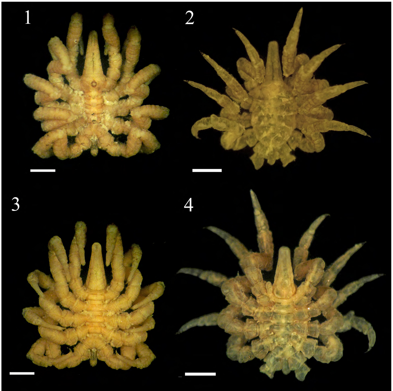
Figures 1–4. Pentapycnon geayi collected in Ceará, Brazil. 1. Dorsal view of the female. 2. Dorsal view of the male. 3. Ventral view of the female. 4. Ventral view of the male. LIMCE-UFC 904. Scale bar: 1 mm.

brownish cream in colour, trunk compact, fully segmented, with small granules in the cuticle and four strong tubercle dorsomedian placed directly posterior to ocular process (tubercle); proboscis conical, distally tapering; lateral processes or (crurigers) short touching at bases, or slightly apart almost touching, and its distal region has a margin with small tubercles; five pairs of legs, moderately short and robust; propodus with small single terminal claw and strong; ocular tubercle circular in dorsal view placed at middle region of cephalic, higher than other dorsomedian tubercles, four equidistant small eyes, darkly pigmented; abdomen horizontal, jointed from underneath the fifth segment; ovigers relatively small and short 7-segmented,