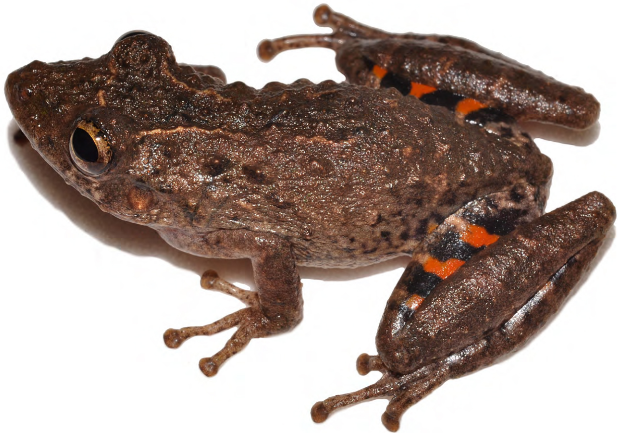
Figure 2. Adult male in life of Scinax rostratus (AAG-UFU 5573; SVL of 31.5 mm) from the municipality of Cantá, state of Roraima, northern Brazil.