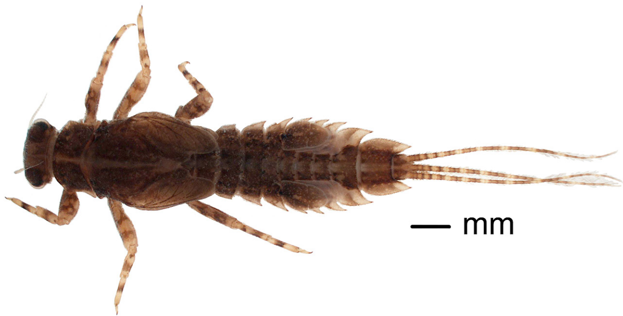
Figure 1. Nymph of Eurylophella karelica from Estonia (collected in the Narva River, downstream, 30.09.2010). Scale bar = 1 mm.