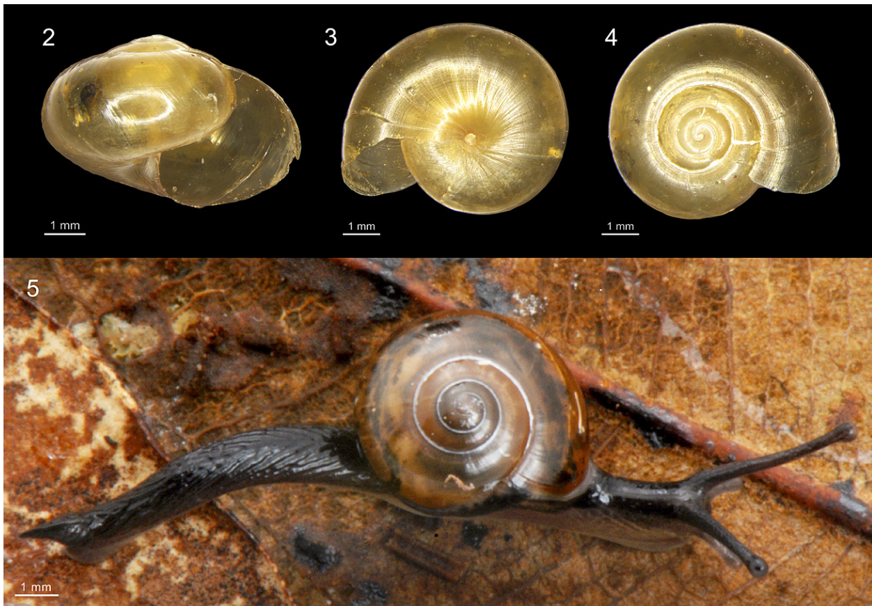
Figures 2–5. Specimens of Ovachlamys fulgens (MZSP 134512) found in Japuá, Xixová-Japuá State Park, municipality of São Vicente, São Paulo state, southeastern Brazil. 2–4 show an empty shell. 2. Aperture view. 3. Umbilical view. 4. Dorsal view. 5. A second individual, alive.

Capinera and White 2011). The species was also identified by its escape behavior (Teixeira 2017). However, until the reproductive anatomy and sequencing the barcoding COI are known, the species identification is only a tentative. The species identification was also corroborated as probably O. fulgens by Dr Zaidett Barrientos (Universidad Estatal a Distancia, Costa Rica), who reviewed our photographs of observed individuals.