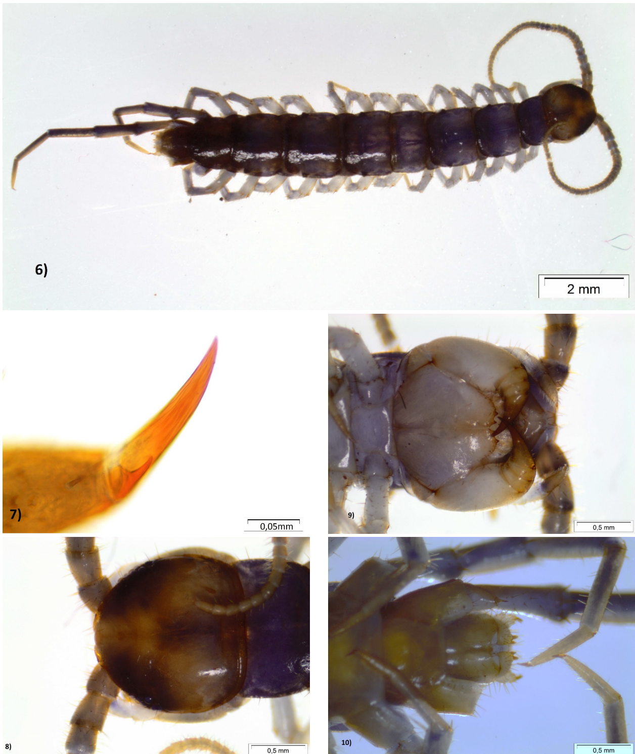
Figures 6–10. Lithobius (Lithobius) obscurus Meinert, 1872, female. Collected in Sogamoso, Vereda la Chorrera. 6. Habitus. 7. Posterior accessory spine of the leg XV. 8. Cephalic plate. 9. Forcipular coxosternite. 10. Postpedal segments.

Description. The specimens examined was characterized by the following set of morphological features: dark brown or grey yellowish colour, body length 13–18 mm. This species is characterized by having triangular projections on the posterior angles of TT 9, 11 and 13 (Figure 6) and having a posterior accessory spine on the 15th leg (Fig. 7). Antennae of 25 to 26 articles, ocelli 9–12 arranged in 3 rows (Fig. 8) and forcipular coxosternite with 2+2 teeth over the anterior edge (Fig. 9). Only 2