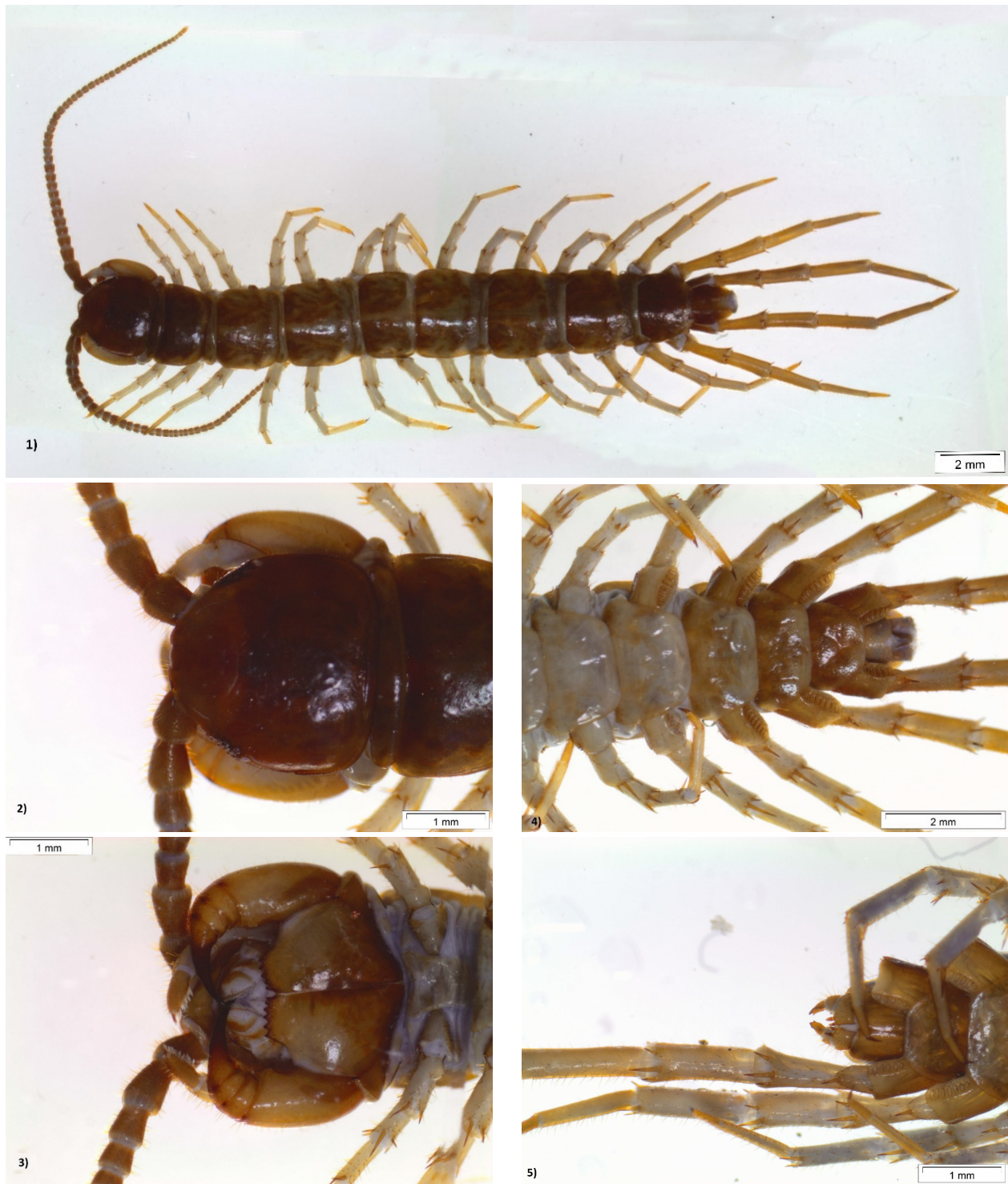
Figures 1–4. Lithobius (Lithobius) forficatus (Linnaeus, 1758), male, collected on campus of Universidad Nacional de Colombia, Bogotá. 1. Habitus, male, dorsal view. 2. Cephalic plate, dorsal view. 3. Forcipular coxosternite. 4. Coxal pores of last legs. 5. XIV and XV legs.

074°07.55' W, 2600 m; LIT-0016, 1 ♀, Bogotá, A. Santafe, 12-IV-2008, 04°37.99' N, 074°07.55' W, 2600m; LIT-0017, 1 ♀, Tenjo, C. Forero, 3-III-2002, 04°52.18' N, 074°08.63' W, 2685 m; LIT-0020, 1 ♂, Bogotá, N. González, 18-I-2012, 04°37.99' N, 074°07.55' W, 2600 m; LIT-0021, 1 ♂, La Vega, D. León, 5-V-2005, 04°59.95' N, 074°20.46' W, 1230 m; LIT-0022, 1 ♀, Fusagasuga, E. Patiño, 16-V-2002, 04°20.49' N, 074°22.95' W, 1500 m; LIT-0023 1 ♀, La Mesa, 12-VIII-2004, 04°37.81' N,