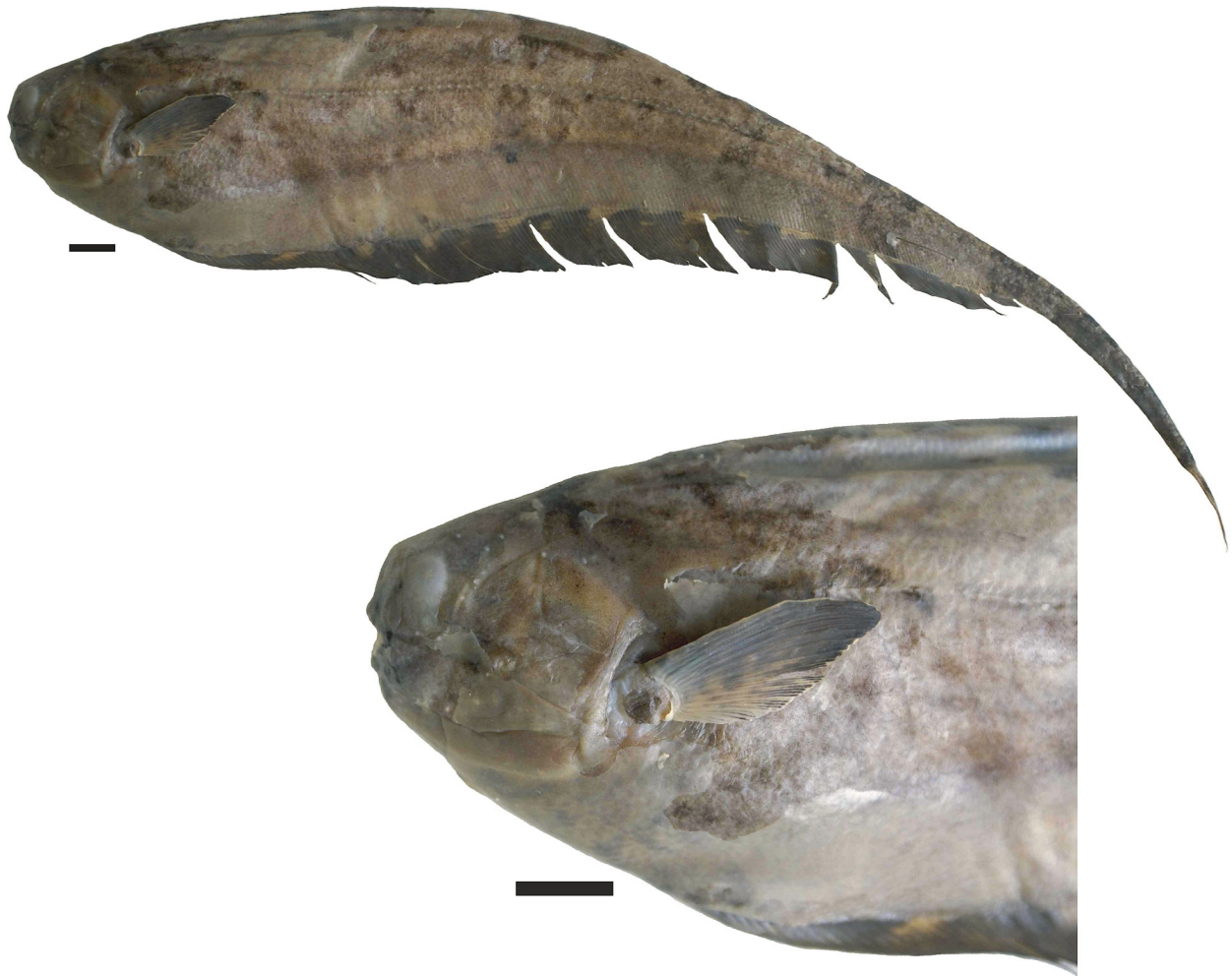
Figures 2. Steatogenys ocellatus , CIACOL 513. Scale bars = 10 mm.

methods as Crampton et al. (2004). The specimen is 330.02 mm in total length; contains a conspicuous dark spot at the base of pectoral-fin base, an irregular pattern of pectoral-fin pigmentation, 13 pectoral-fin rays (fewer than type specimens), 182 anal-fin rays, 10 scales over lateral line, and 103 lateral line scales. With the exception of the pectoral-fin rays, meristic counts are within the ranges of the type specimens. Most of the morphometric measurements fall within the ranges of those from type specimens (Table 1). Nevertheless, body depth and body width, measured as percentage of the length to the end of the anal fin (LEA), differ significantly. We assume that there must be a mistake in the original description manuscript for these 2 measurements, because it is highly improbable that the body depth values are greater than the LEA.