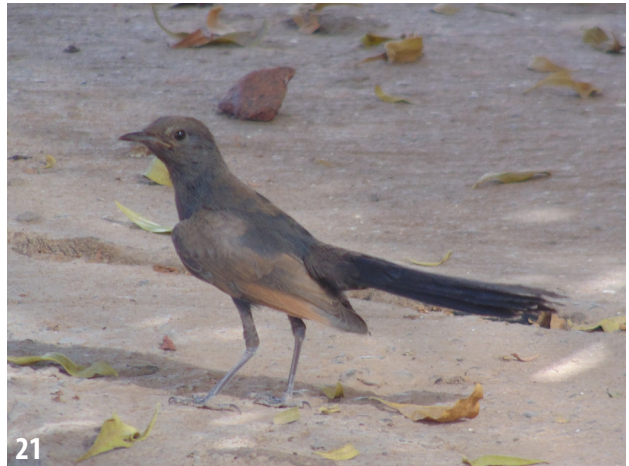
Figures 18–21. Birds detected during a terrestrial vertebrate inventory in Aldesa Valley, Saudi Arabia, May–August 2014–2015. 18. Argya squamiceps , Arabian Babbler. 19. Oenanthe leucopyga , White-crowned Wheatear. 20. Oenanthe melanura , Blackstart. 21. Cercotrichas podobe , Black Scrub-robin.