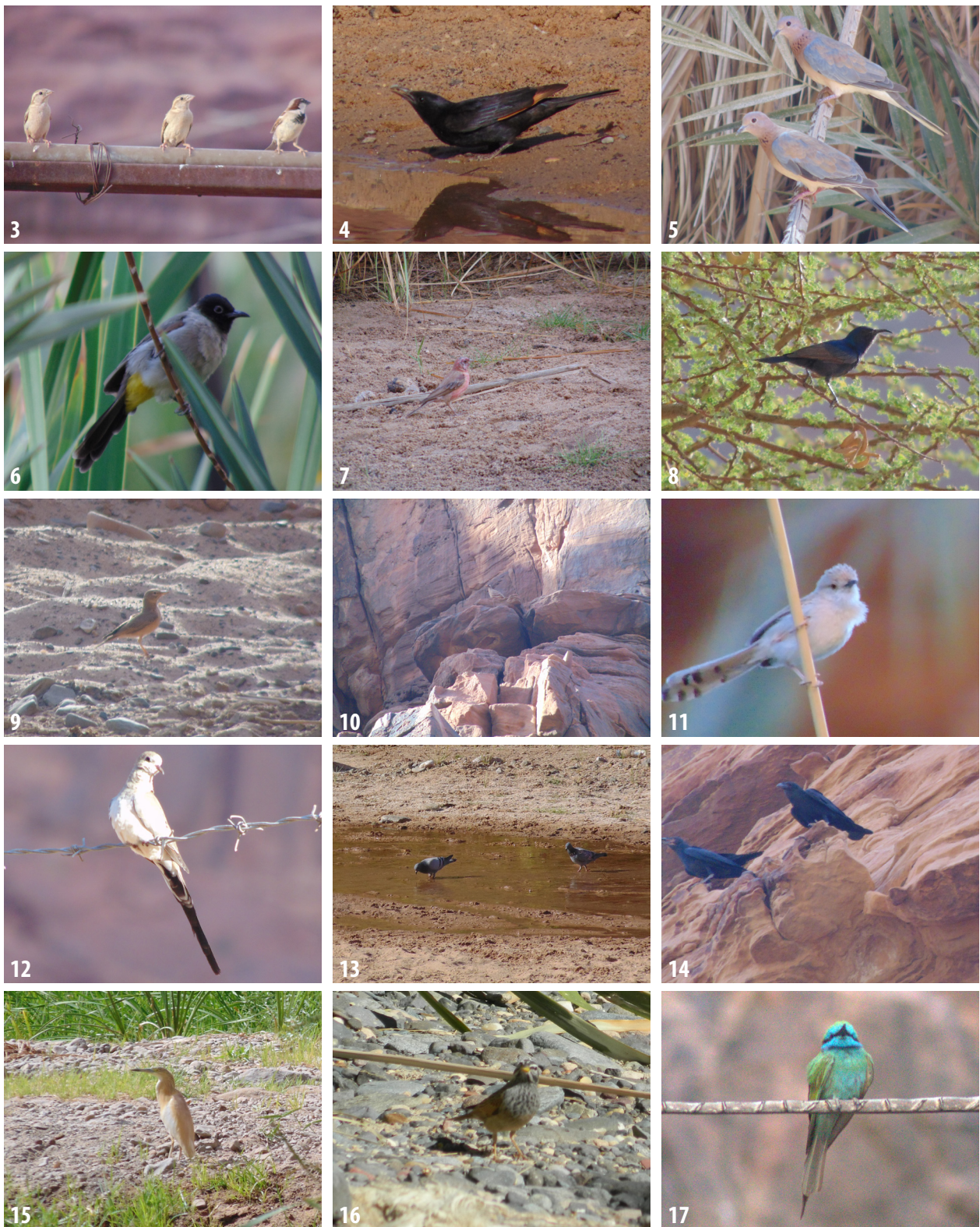
Figures 3–17. Birds detected during a terrestrial vertebrate inventory in Aldesa Valley, Saudi Arabia, May–August 2014–2015. 3. Passer domesticus , House Sparrows. 4. Onychognathus tristramii , Tristram’s Starling. 5. Spilopelia senegalensis , Laughing Doves. 6. Pycnonotus xanthopygos , White-spectacled Bulbul. 7. Carpodacus synoicus , Sinai Rosefinch. 8. Cinnyris osea , Palenstine Sunbird. 9. Ammomanes deserti , Desert Lark. 10. Ammoperdix heyi , Sand Partridge. 11. Scotocerca inquieta , Streaked Scrub-Warbler. 12. Oena capensis , Namaqua Dove. 13. Columba livia , Rock Dove. 14. Corvus ruficollis , Brown-necked Raven. 15. Ixobrychus minutus , Little Bittern. 16. Emberiza striolata , House Bunting. 17. Merops orientalis , Green Bee-eater.