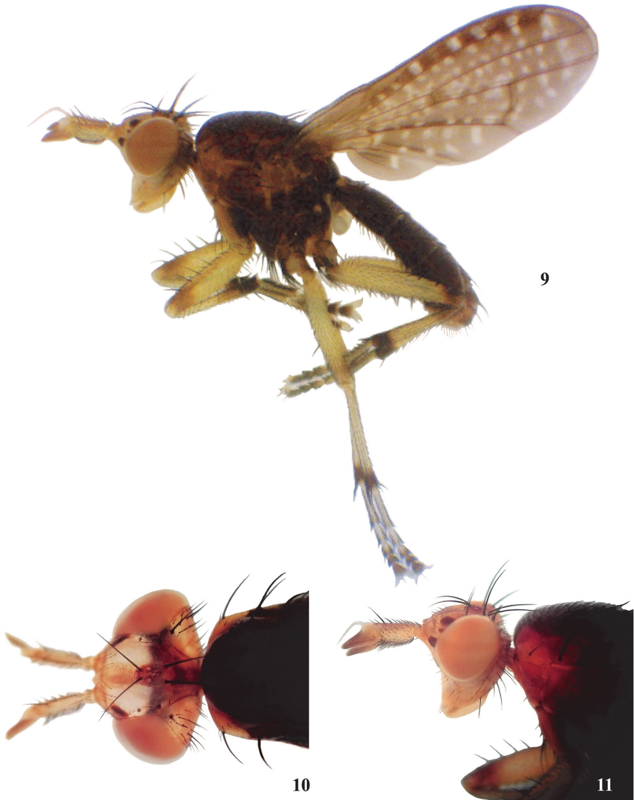
Figures 9–11. Protodictya lilloana Steyskal 1953. 9. Habitus, lateral view. 10. Head, dorsal. 11. Head, lateral.

distribution of all congeners and can be differentiated from other species of the genus using the key in Freidberg et al. (1991). Protodictya lilloana can be identified using the key in Marinoni and Knutson (1992). Adults are dark brown with a frontal facial black spot in the anterior half (Figs 10, 11). The antenna with third antennomere apically darkened bearing a plumose arista. Wings have apical hyaline spots in cells r_{2+3} and r_{4+5} aligned (Fig. 9).