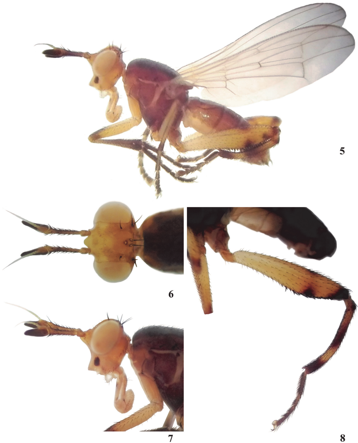
Figures 5–8. Sepedonea lindneri (Hendel, 1932). 5. Habitus, lateral view. 6. Head, dorsal. 7. Head, lateral. 8. Hind leg, lateral.

y Luis Casales (1 specimen). General Enrique Martínez (33°12'8.15" S, 53°50'47.98" W, 14-XI-2013, 17-III-2014, 13-X-2014) Leticia Bao, Luis Casales y María Carballo (5 specimens). Julio María Sanz (33°11'54.99" S, 054°05'12.30" W, 14-XI-2013, 28-XI-2013) Leticia Bao y Luis Casales (4 specimens). P. lilloana was mainly found in rice crop, with 2 specimens collected in adjacent native vegetation patches and 1 specimen collected on pasture (Table 1).