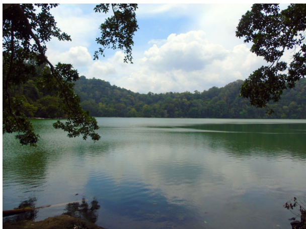
Figure 2. Danau Kastoba location where O. niloticus found in Bawean Island

Identification. Meristic and Morphometric characters of O. niloticus are given in Table 1. Other specific morphological characters are as follows: scales cycloid; gill rakers short; 3 rows of scales on cheek; maxilla and lower jaw equal; teeth widen; pectoral fin pointed; dorsal, pectoral and anal fins blunt; caudal scaly. Coloration: anal fin faintly barred; caudal and soft dorsal fin sharply barred; about 9 narrow dark bars on sides body; dark blotch at corner of operculum.