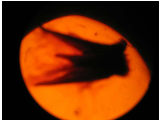
Figure 2. Developed inflorescence