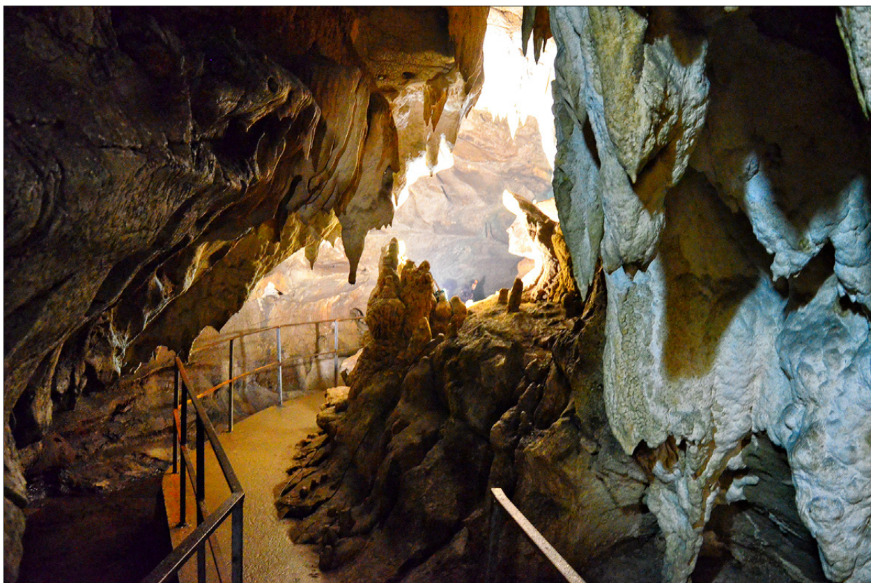
Figure 5. Part of the tourist trail in Ravništarka Cave