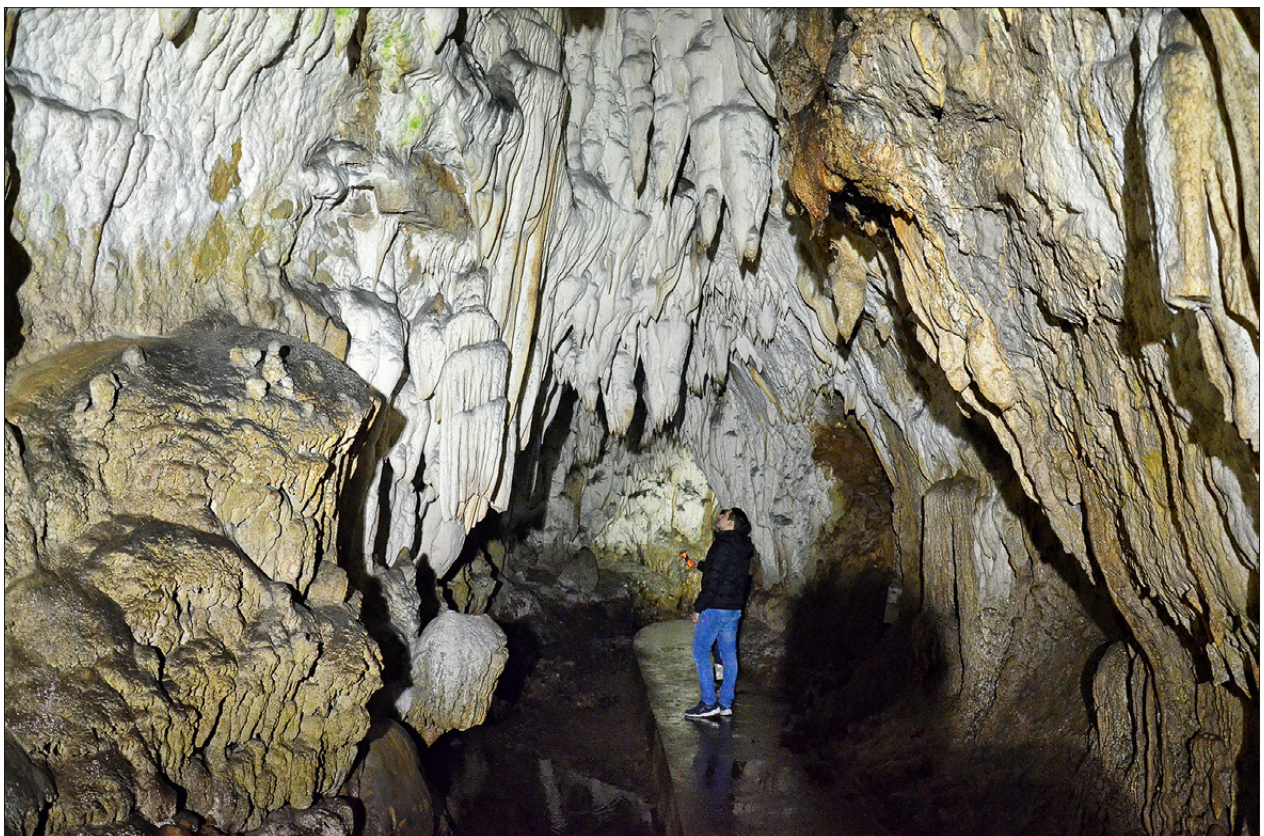
Figure 4. Cave ornaments in Ravništarka Cave