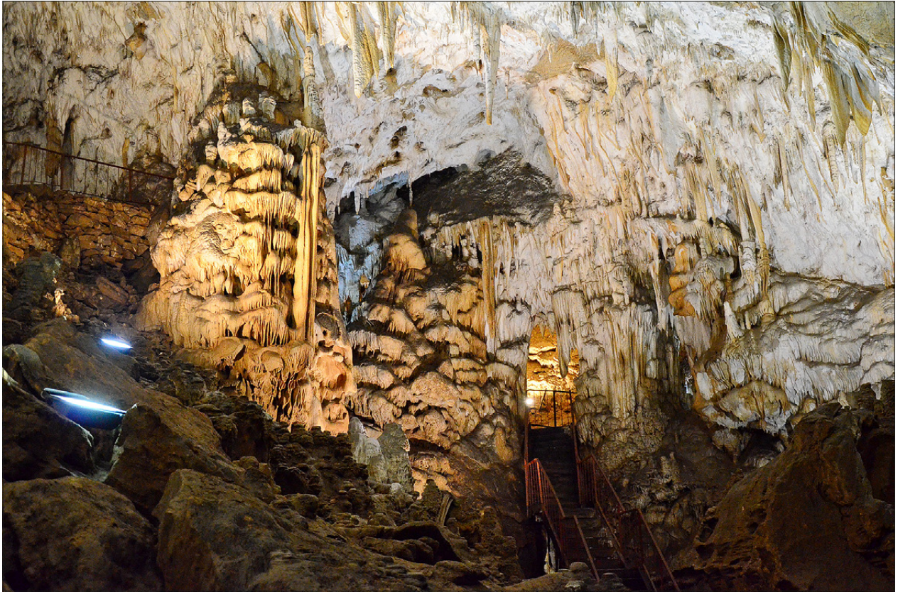
Figure 3. Cave ornaments in Ceremošnja Cave