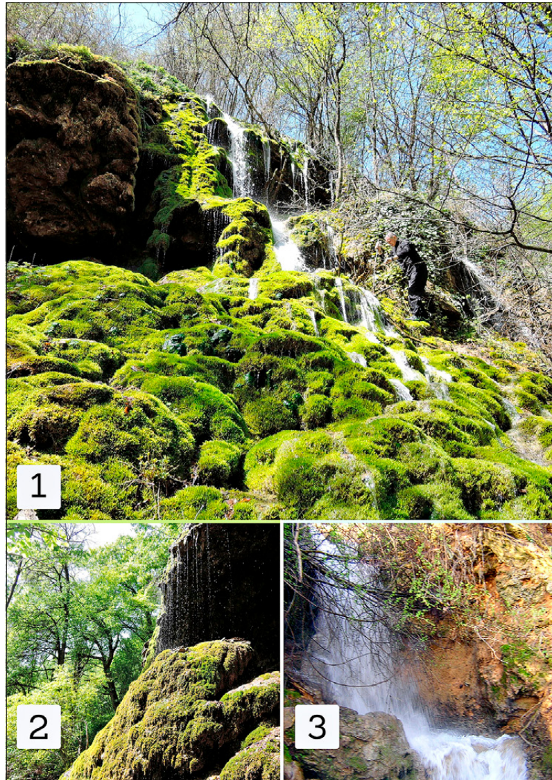
Figure 6. Siga (1), Burev (2) and Malo Vrelo (3) Waterfalls