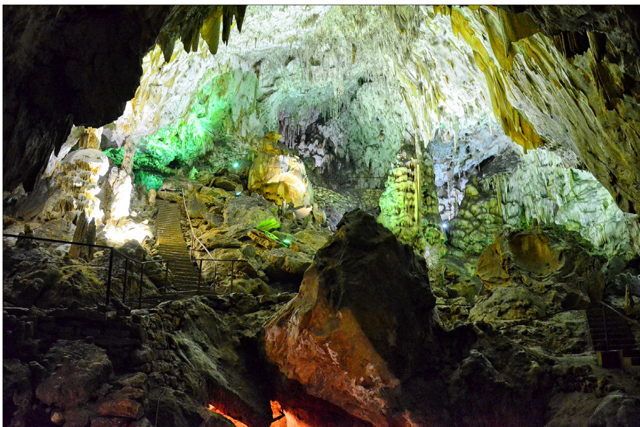
Figure 2. The main hall of Ceremošnja Cave