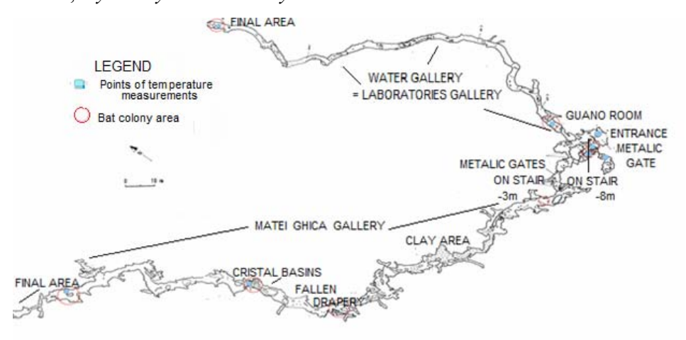
Fig. 3. Cloşani Cave with the main areas hosting hibernating bat colonies in winter 1994–1995 (With additional information from BLEAHU et al. , 1976).

Durring our winter visit, we estimated 500 individuals of R . ferrumequinum spread all along the Laboratories Gallery (Fig. 4) and several tenths of R . hipposideros , R . blasii , Myotis myotis and M . blythii .