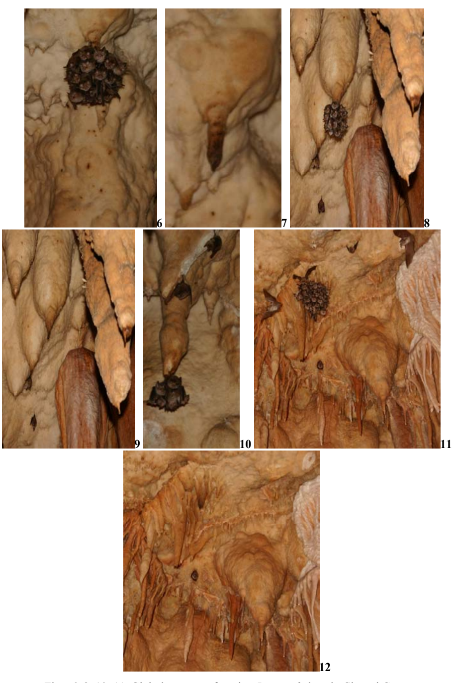
Figs. 6, 8, 10, 11. Globular group of mating R. euryale bats in Closani Cave. Figs. 7, 9, 12. Stalactite support with black extremity, due to the impregnation with pheromonal secretions.