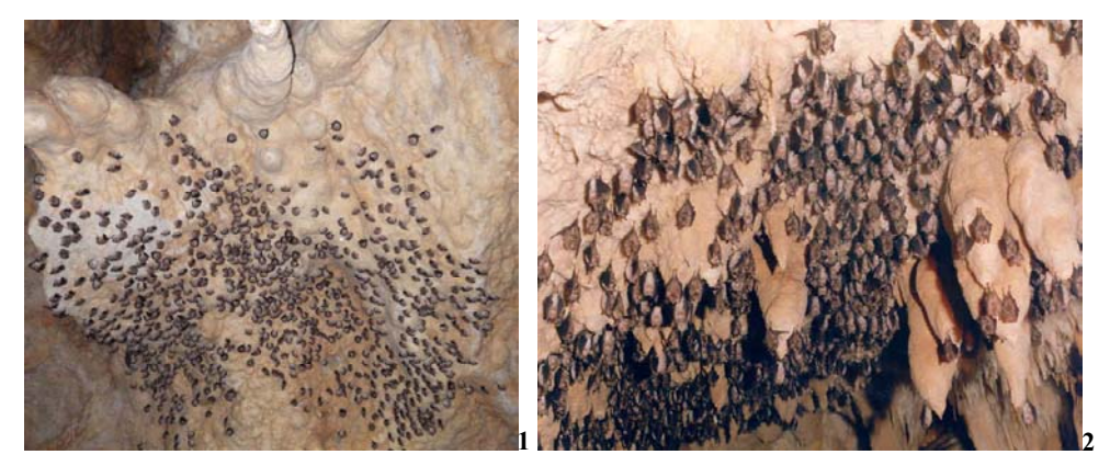
Fig. 1. – left and Fig. 2. – right: Hibernating colonies of individuals of Rhinolophus euryale , in "Ghica" Gallery inside Cloşani Cave.

In the hibernating period, they form groups of up to 1000 individuals. In many cases these large colonies are mixed with other bat species like Miniopterus schreibersii, Rhinolophus blasii Peters, 1866, R. hipposideros Bechstein, 1800, R. ferrumequinum Schreber , 1774, Myotis myotis Borkhausen, 1797, M. blythii Tomes, 1857, M. capaccinii Bonaparte, 1837, M. emarginatus Geofroy, 1806). We never found individuals of R. euryale in these mixed colonies. It is known that generally individuals of rhinolophid species, even when grouped, they are not close and don't touch each other (Fig. 1 and Fig. 2).