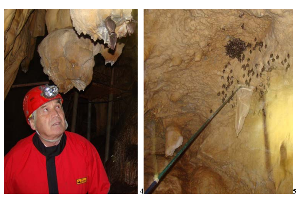
Fig. 4. Rhinolophus ferumequinum from "Ghica" Gallery spread along the Laboratories Gallery, up to End Room.