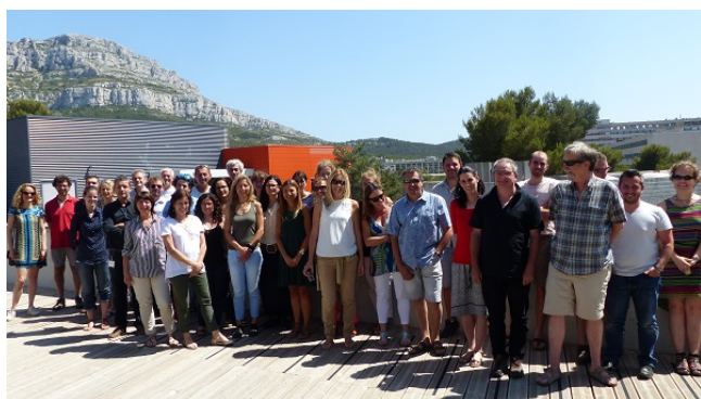
Figure 1. The OUTPACE team preparing the OUTPACE cruise.

“Le monde aurait pu être simple comme le ciel et la mer” – André Malraux