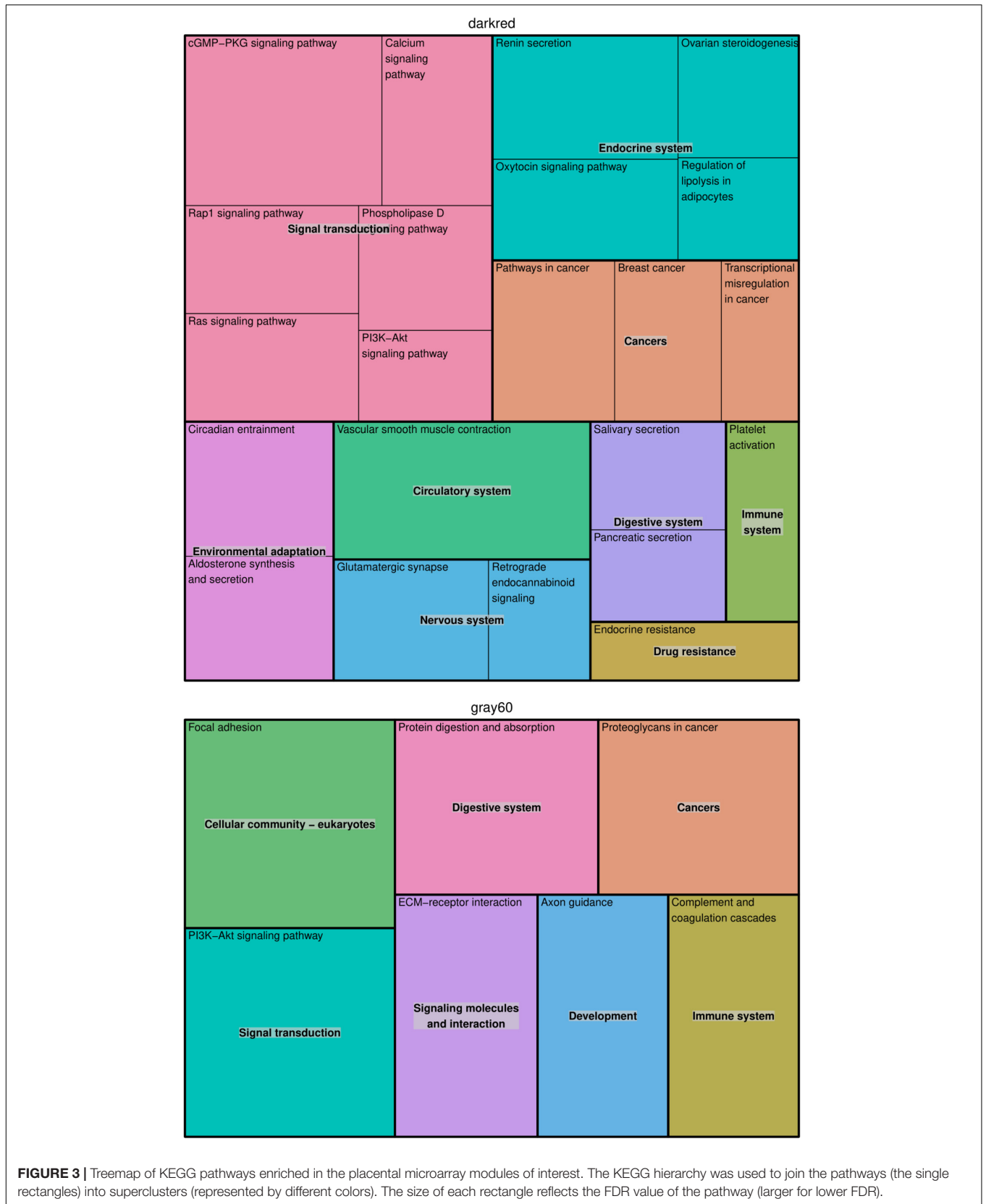
FIGURE 3 | Treemap of KEGG pathways enriched in the placental microarray modules of interest. The KEGG hierarchy was used to join the pathways (the single rectangles) into superclusters (represented by different colors). The size of each rectangle reflects the FDR value of the pathway (larger for lower FDR).