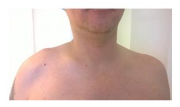
Figure 1. Acromioclavicular dislocation; clinical aspect

We present now a case of a young patient who had an injury by falling on the right shoulder with acromioclavicular dislocation type V (Figures 1-2).