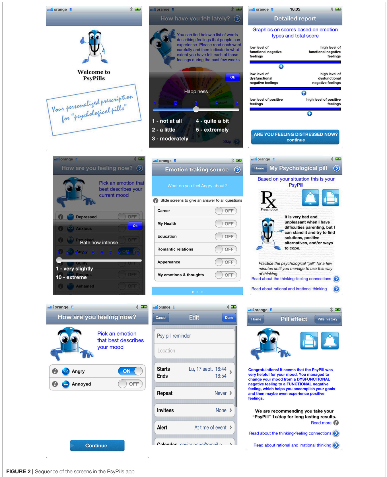
FIGURE 2 | Sequence of the screens in the PsyPills app.