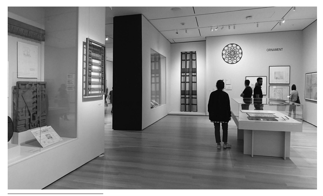
Figure 2 Installation view of "Ornament" gallery, Frank Lloyd Wright at 150: Unpacking the Archive. The Museum of Modern Art, New York, June 12–October 1, 2017.