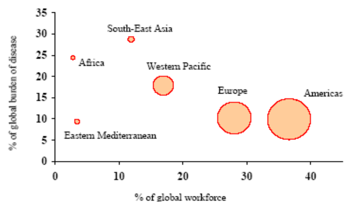
Distribution of health workers by level of health expenditure and burden of disease