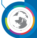
Table 1 (cont.)