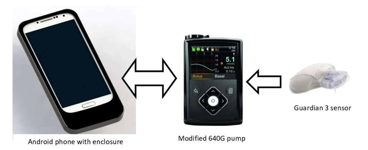
Figure 2 FlorenceM closed-loop system prototype. The system consists of a continuous glucose monitoring transmitter with Guardian 3 sensor (Medtronic), an insulin pump (modified 640G pump, Medtronic) and an Android smartphone running the control algorithm (Cambridge).