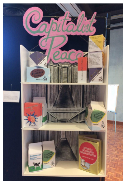
Figures 1a and 1b. Shopping at Capitalist Peace , shown in June 2016 at the Consumer Culture Theory conference, Lille Grand Palais, Lille, France.