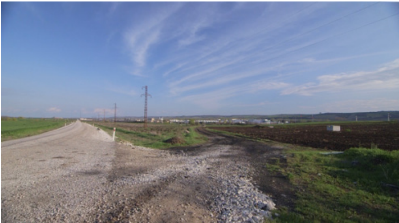
The Kapikule crossing between Turkey and Bulgaria with Greece in the distance.

Turkey and Bulgaria, which is the second busiest land border crossing in the world. We were shown around the border by a customs official who pointed out a low-slung building at the edge of a large concrete expanse. It was the building that housed the x-ray, and we were told of the time when it revealed the bodies of several people in a lorry, mostly Syrians who were attempting to cross the border into Europe. We were first offered the x-rays but then having reconsidered they offered us images that the customs officials themselves had taken on their mobile phones, since these were not seen to be subject to the same rules as the official images. Needless to say we did not take them but again the issue of the ethics of image production, of what can be revealed, what can be shown and what indeed is ethically and politically possible to see, comes up.