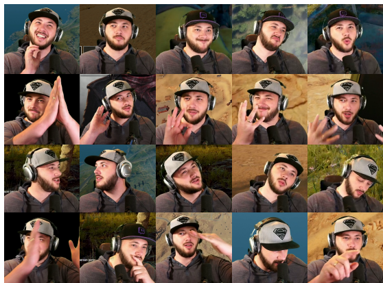
Figure 2: Camera stills from a typical game stream, including various facial expressions, body gestures, head poses, as well as challenging frames with face occlusions.

expressions and gestures respectively, as expressed by the streamer while communicating with viewers and other streamers. The third and fourth rows contain stills capturing head pose variability, as