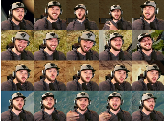
Figure 3: Sequences from episodes extracted by applying [9] on face video, player audio, and game footage.

features are extracted by using the principal components of Fourier coefficients, while subsequently a recurrent layer is used for fusion. The premise is that a high reconstruction error points to novelty, and novelty can be considered as a proxy for detecting interesting parts of the stream. This also deems the method suitable for segmenting a long stream into episodes that are likely to contain emotional and social content, especially when utilizing the streamer’s face and voice. Evaluation was carried out on over 5 hours of footage broadcasted by two streamers playing a popular game. Results presented in [9] show that, as expected, analysis of facial expressions and audio significantly increases the precision of detected episodes, compared to simply using the game footage. In Fig. 3, we show some sequences from detected episodes where social and behavioural signals can be observed. In the first row, the sequence shows the player winning a game and reacting positively to this. In the second, the player is reacting to an in-game event. In the third row the player appears intrigued. Finally, in the fourth row the streamer is interacting with viewers.