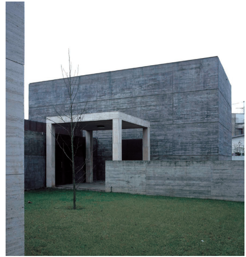
Fig. 05. José Fernando Gonçalves. Mortuary Chapels, Vila Nova de Gaia (Portugal), 1994/97; external view. Fig. 06. View of the entrance. Fig. 07. Plan