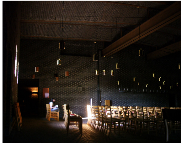
Fig. 02. Sigurd Lewerentz. Saint Peter, Klippan (Sweden), 1963.

configuration and materiality of modern architecture. Again Forty (2000) gives us clues to understand these contaminations when he explains that interest in the character of architecture is a symptom of the decline of semiotic theories of meaning in favor of phenomenological analyzes of meaning.