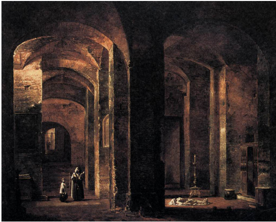
Fig. 01. Francois-Marius Granet. San Martino ai Monti, Rome, 1806.