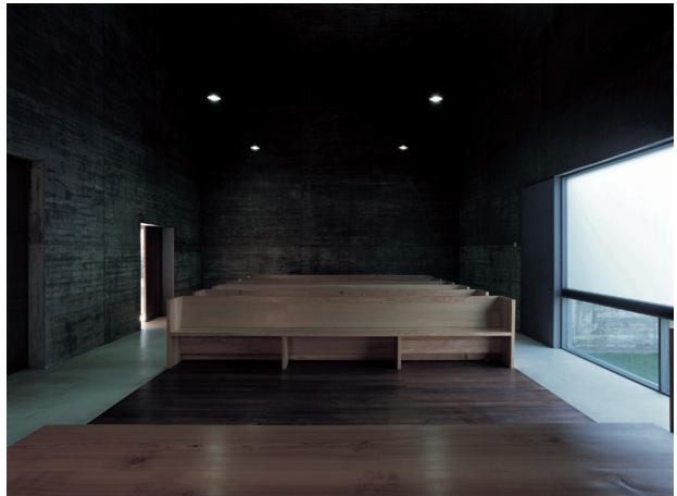
Fig. 08. José Fernando Gonçalves. Mortuary Chapels, Vila Nova de Gaia (Portugal), 1994/97; gallery.