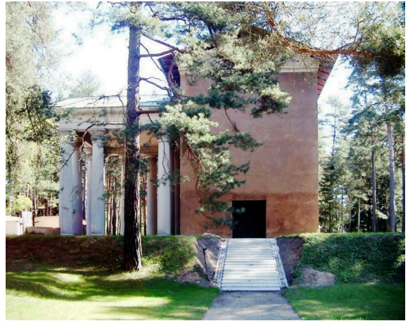
Fig. 04. Sigurd Lewerentz. Chapel of Resurrection, Woodland Cemetery, Stockholm (Sweden), 1925.

both architects, and the Klippan church (1963) from the latter (Fig. 03-04).