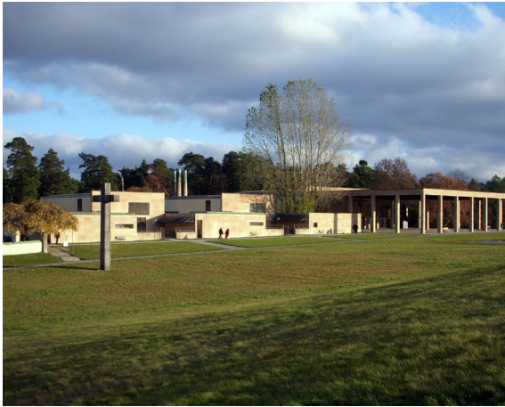
Fig. 03. Erik Gunnar Asplund. Chapel of the Holy Cross, Woodland Cemetery, Stockholm (Sweden), 1935/40.